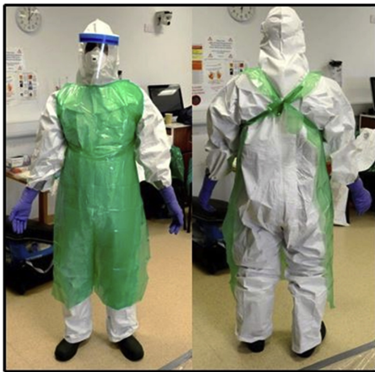
Figure A.5. Personal protective equipment worn when assessing a patient suspected of having a high-consequence infectious disease at Royal Liverpool Hospital.