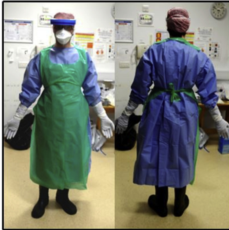
Figure A.2. Personal protective equipment worn when assessing a patient suspected of having a high-consequence infectious disease at London's Royal Free Hospital.