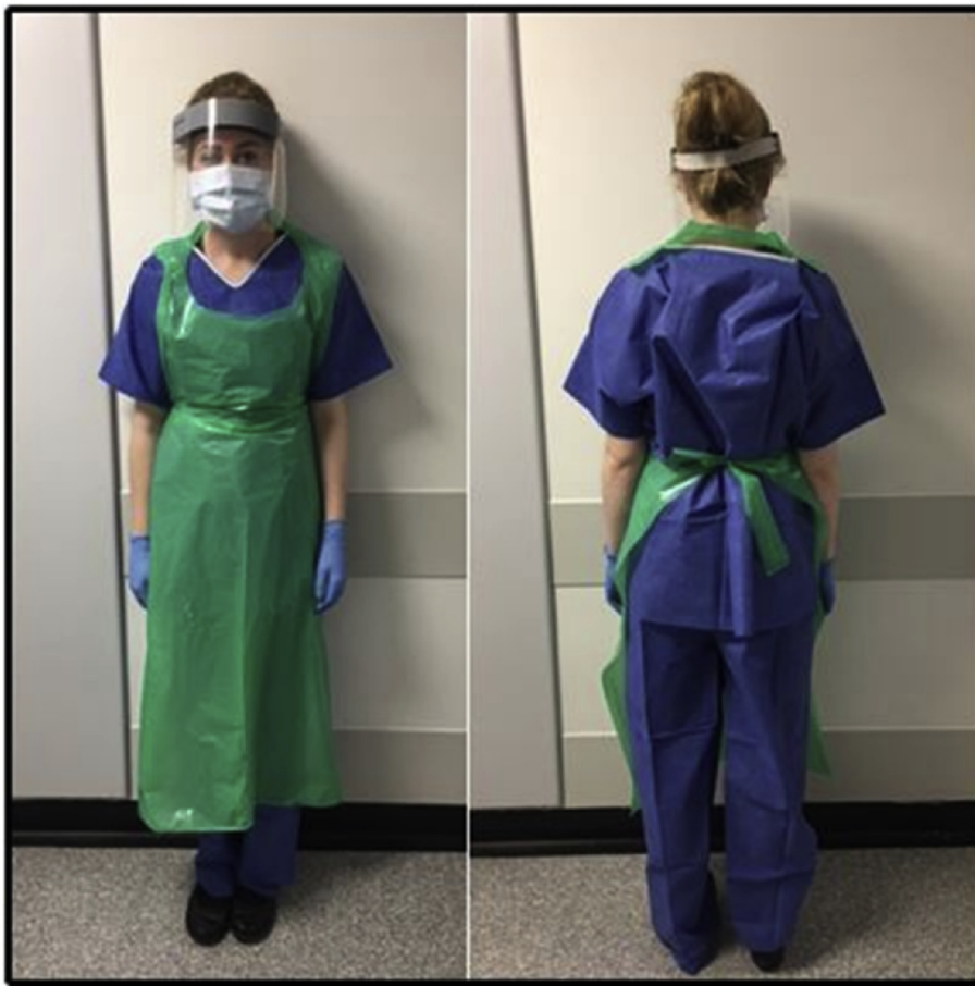
Figure A.1. Basic level (enhanced precaution) personal protective equipment.