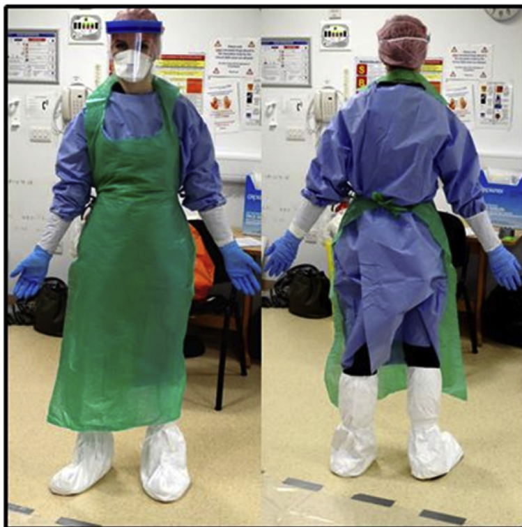
Figure A.3. Personal protective equipment worn when assessing a patient suspected of having a high-consequence infectious disease at Sheffield Teaching Hospitals NHS Trust.