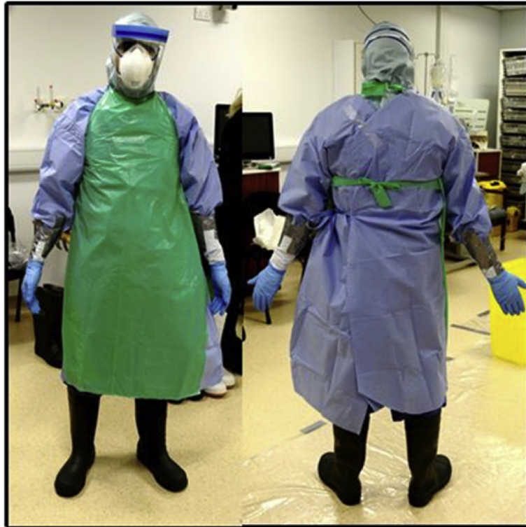
Figure A.4. Personal protective equipment worn when assessing a patient suspected of having a high-consequence infectious disease at Newcastle upon Tyne Hospitals.