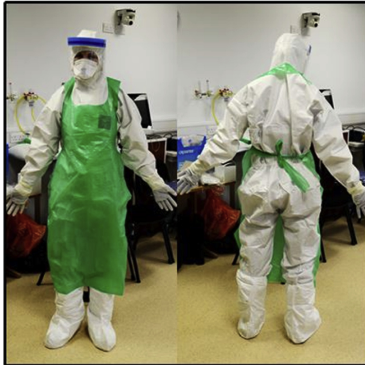
Figure A.6. Personal protective equipment worn when assessing a patient suspected of having a high-consequence infectious disease at NHS Scotland Greater Glasgow and Clyde.