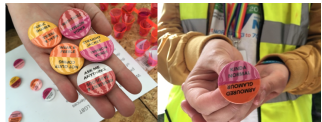
Figure 7 (left) a range of UnBinary Badges (right) Sapphire's badge

The design of the badge-making activity disrupts the possibility of static narratives and identity positions, they introduced dialogue and improvised meaning making. They still have enough coherence to have meaning, but are ambiguous enough to be generative of multiple meanings and narratives. While the badges were inspired by our data rather than the product of thematic coding, they do speak of and speak to the dialogue within the workshops.