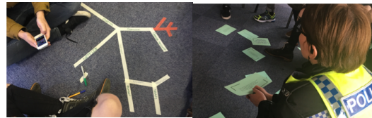
Figure 1: Young people and police officer in workshop 1

In response to this, we consider how HCI research can communicate the risks people face without reproducing stigmatizing narratives of passive vulnerability. We reflect upon the ways that visual communication design was used to communicate our findings by depicting ambivalence towards vulnerability to hate crime. We argue that by including ambivalent elements in our communication design we can 'trouble' ideas of vulnerability and resist static narratives about our participants' identities.