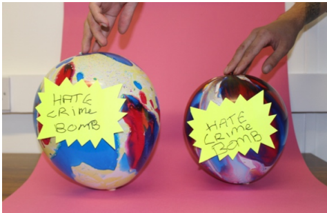
Figure 4 Sapphire's 'Hate Crime Bomb'