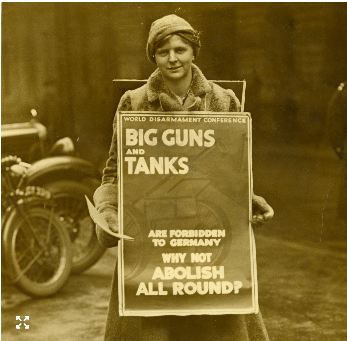
A WILPF member publicising the 1932 World Disarmament conference.