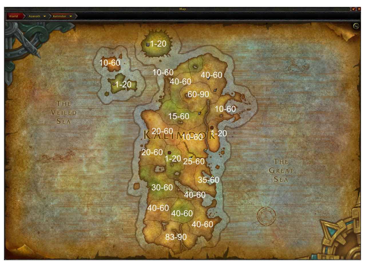
Figure 9: Leveling map of the continent of Kalimdor. The numbers for each zone indicate the level range necessary to adventure in that region. Players are not restricted from traveling to regions above their character level, but they will most likely be unable to survive fights with mobs there due to the disparity in power.

All of this requires discipline to commit to a set schedule during the week with other guild members to dedicate themselves collectively to playing through quests, dungeons, and raids to attain the goals presented in a given expansion's narrative. These goals generally involve overcoming the major villains that have been defined in the story that unfolds in-game as well as via non-interactive cut-scenes over the course of several months.