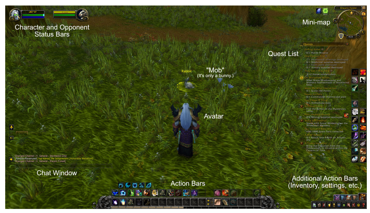
Figure 2: WoW user interface. An example of a typical interface layout highlighting the major aspects of the display.

sits a text box which can displays both a running log of combat information as well as a separate tab for text chat between players. Finally, the right side of the screen can be used to display additional icons controlling more character actions.