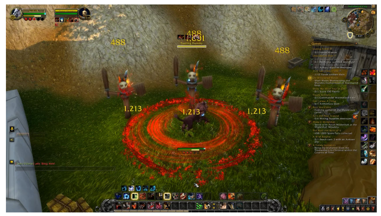
Figure 10: Shades of Wacquant. This screenshot depicts me practicing rotations using training dummies in Stormwind. With repetition, one gets a feel for order and timing of keypresses that result in the greatest amount of damage-dealing.

keep track of, and requires a greater degree of awareness over and above that necessary to keep track of basic actions and avoiding being in an opponent's area of attack.