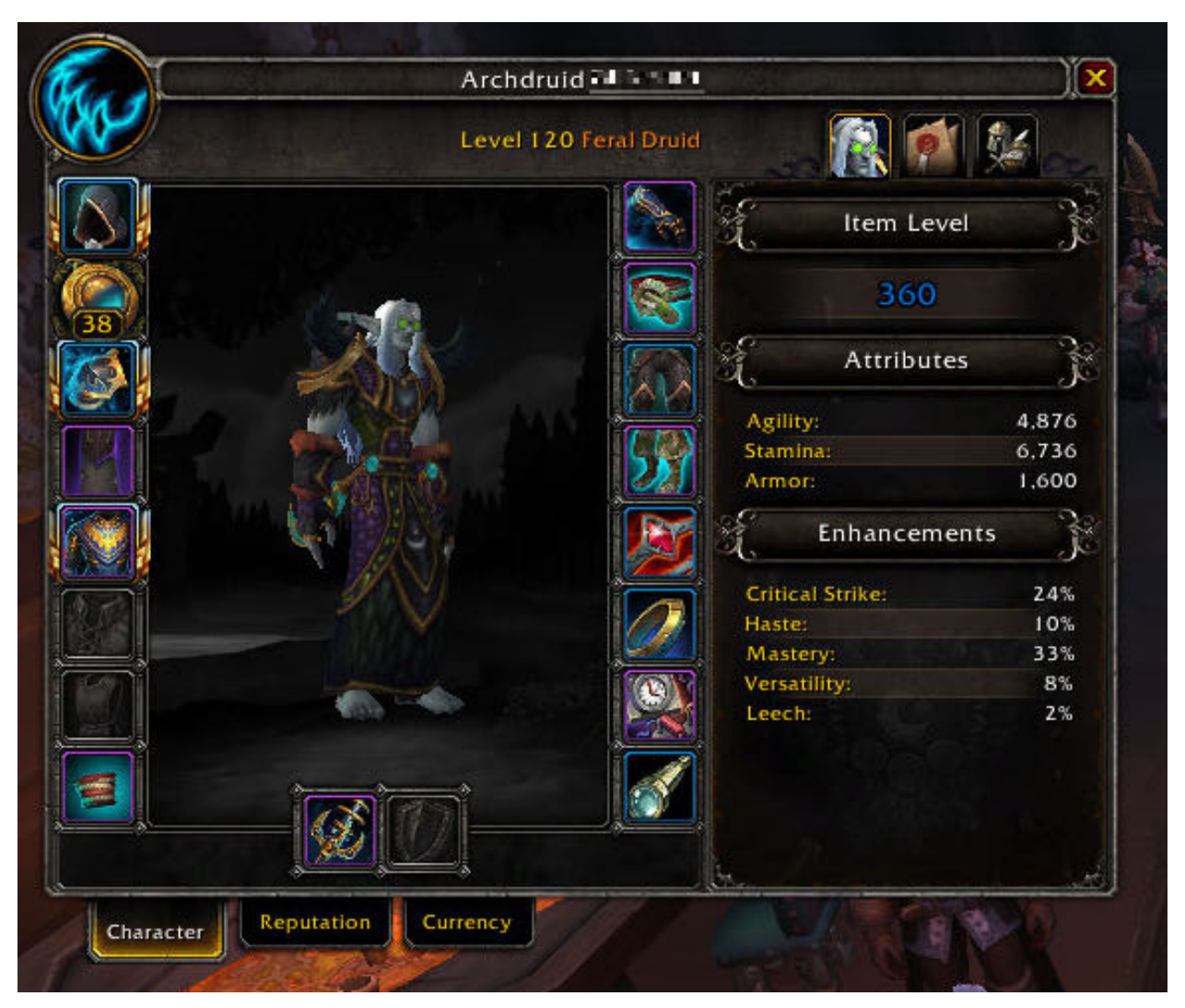
Figure 6: Character panel in WoW. This shows what gear is being used, along with important statistics relevant to play. Note the "Archdruid" title preceding the characters (anonymized) name. Also note the "Item Level," which is an aggregate of this character's overall power in combat. An ilevel is used by Blizzard as a gatekeeper value for permitting access to higher-level instances, and is used informally by more "hardcore" players to determine whether or not someone will be allowed to join them in a raid.

Transmogrification is a cosmetic process available to players within WoW. Every item of gear in the game has a particular appearance. Whenever a new weapon or article of armor is picked up by a character, that appearance is saved to a database of forms that, upon paying a fee to NPCs capable of doing so, can then be applied to any other gear of the same type that a