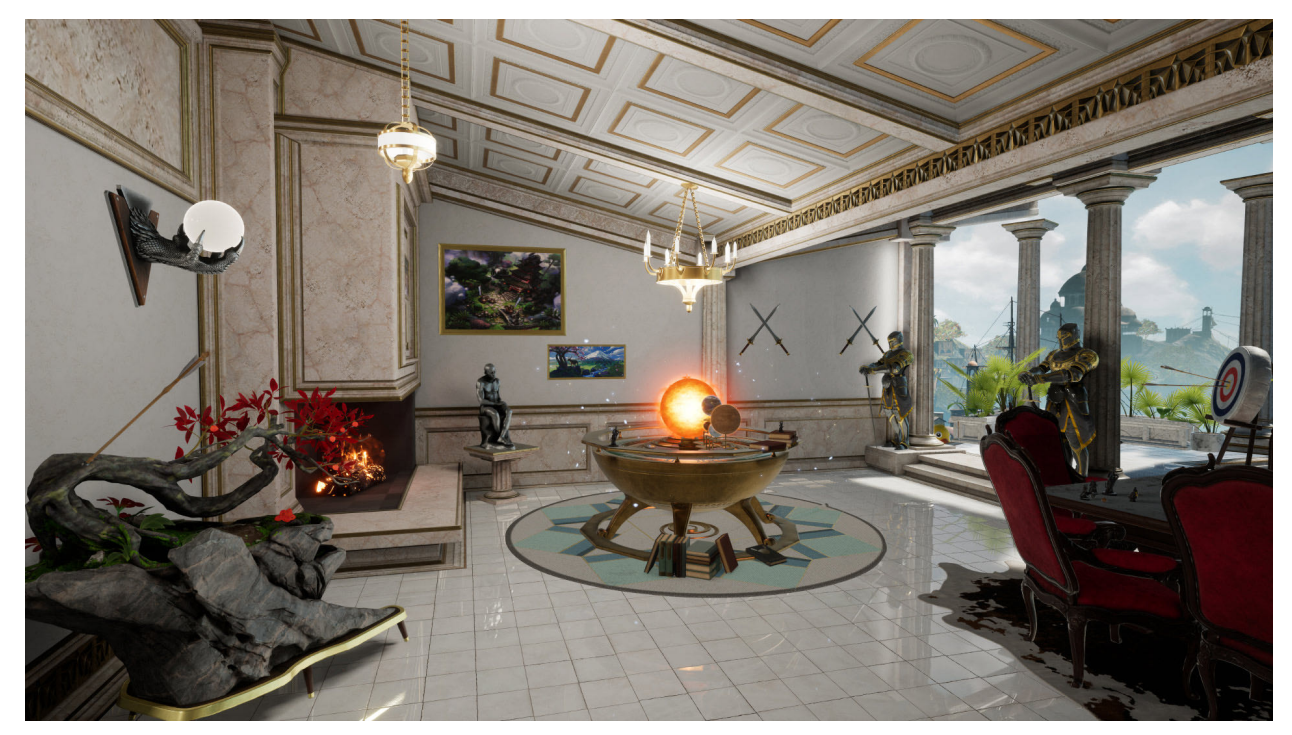
Figure 14: An example of an Oculus Rift "home."

then holding a controller forward, one could teleport outside the confines of the home location. It turned out that each home template was located within a much larger space, which could then be populated with 3D models to decorate just as the provided "living room" spaces. Several users took advantage of this "bug," and had shared this information amongst themselves through their friend networks. Over a couple of months, I began to see the fruits of this communication as increasingly elaborate homes became publicly available in order to show off their owner's work.