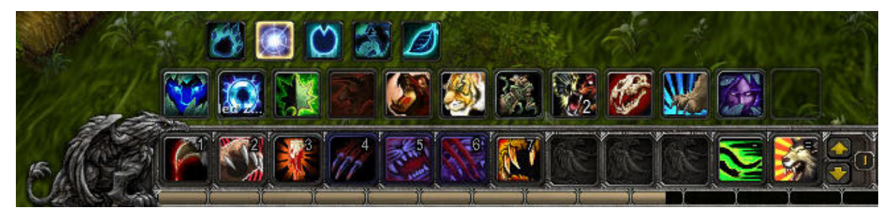
Figure 11: Default action icons for a druid character. The default set lacks keybindings for anything other than the main abilities in the lower left side of the display (number keys 1-7).