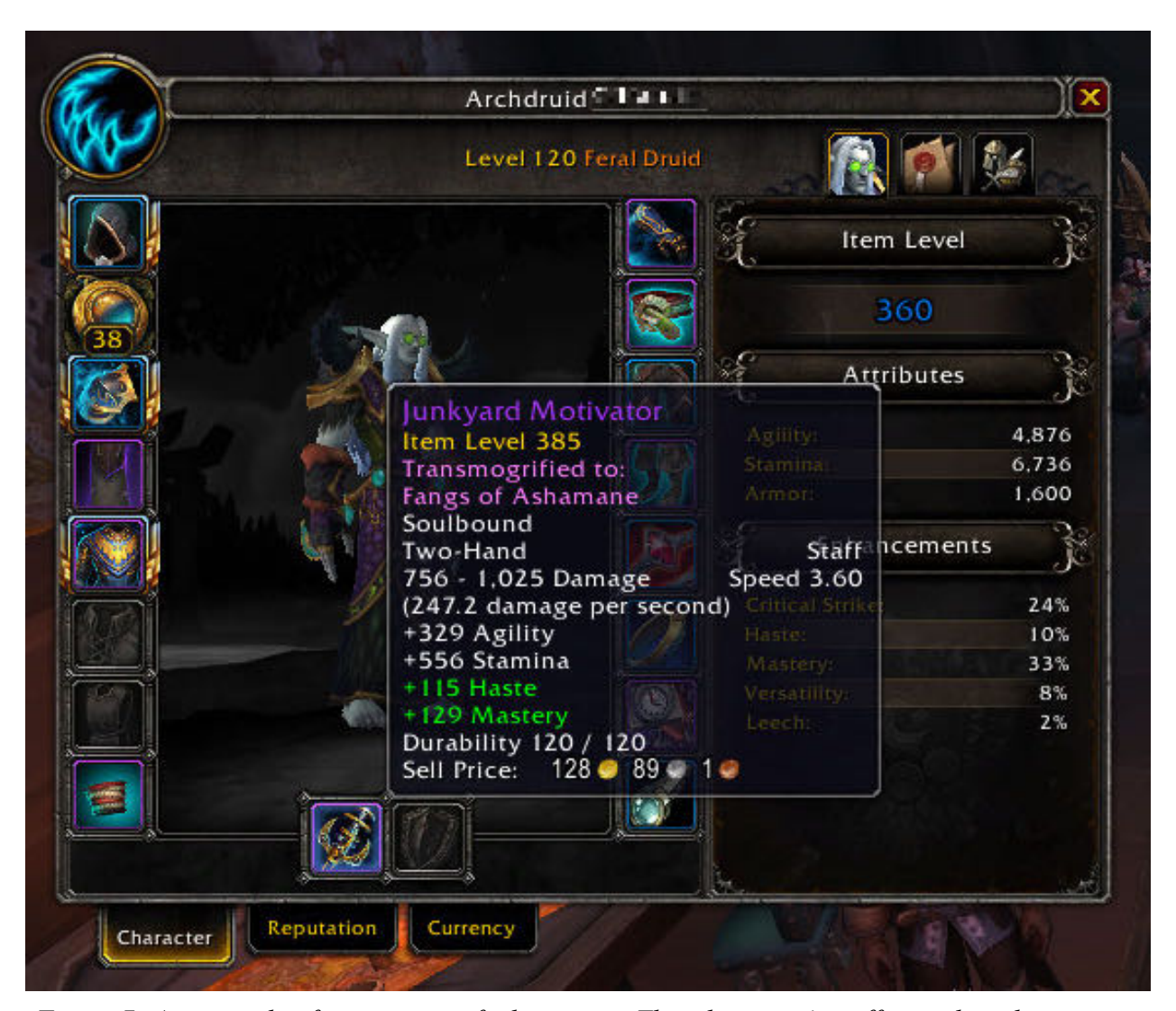
Figure 7: An example of a transmogrified weapon. This character's staff was altered to appear like twin daggers (the "Fangs of Ashmane"). This screenshot also highlights gear attributes. Each weapon or armor piece has a specific set of bonuses which contribute to the overall item level of the character. The higher the bonuses, the more powerful the gear.

Paladin characters today can still be seen wielding Verigan's Fist, thanks to transmogrification. By giving its appearance to a more up-to-date weapon, players communicate to their peers that they have been playing WoW for at least nine years, and (if attached to a level 120 character) they have invested that much time playing as a paladin. The implication to others