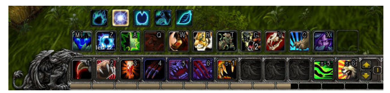
Figure 12: Customized action icons for a druid character. Note that each icon has a letter or number corresponding to the key or key combination used to activate them. This customized set has been altered to use those keys for nearly all commands. In this way the mouse is used only for locomotion, while the keyboard is used for all other duties using the player's left hand.

"Each slot on the standard action bar corresponds to a key on your keyboard. To trigger an ability, you can press the corresponding button on your keyboard. Simple!"