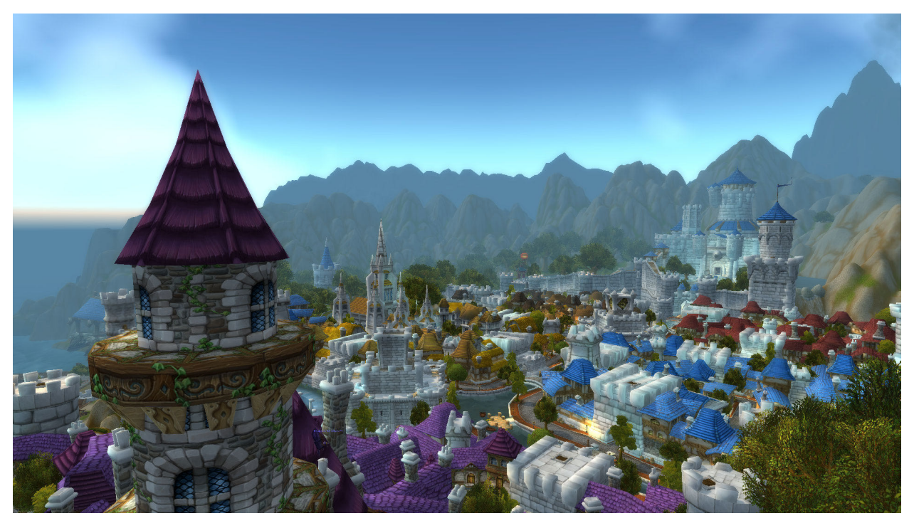
Figure 4: An aerial view of Stormwind. Founded by humans. this is the capital city of the Alliance faction within WoW.