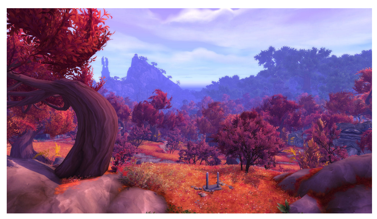
Figure 5: Suramar. A bucolic yet dangerous region found in one of the later expansion packs.