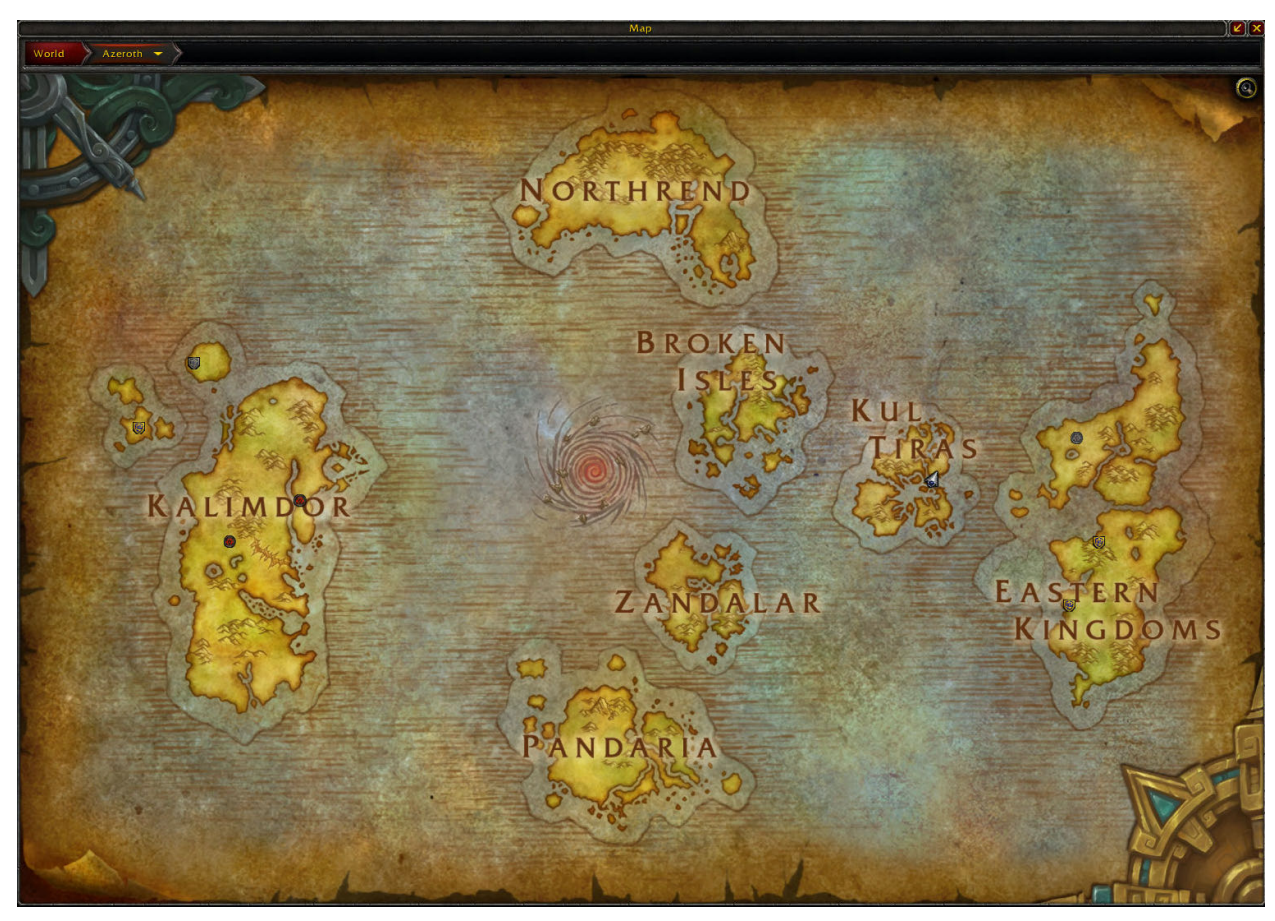
Figure 1: A map of the game world, Azeroth.

sound "white." Humans sound like white Americans, dwarves have gruff Scottish brogues, and night elves sound vaguely English. The Horde, however, can be taken to represent "the bad guys." Their member races are clearly "othered" in comparison to the Alliance, and are usually cast in villainous roles in other fantasy games, along with novels and films. Distinct from the Alliance, spoken accents tend to be those from non-European backgrounds. Trolls in particular are portrayed with black Caribbean accents, with references to voodoo. As another example, tauren are explicitly coded as Native American in terms of clothing and dialect.