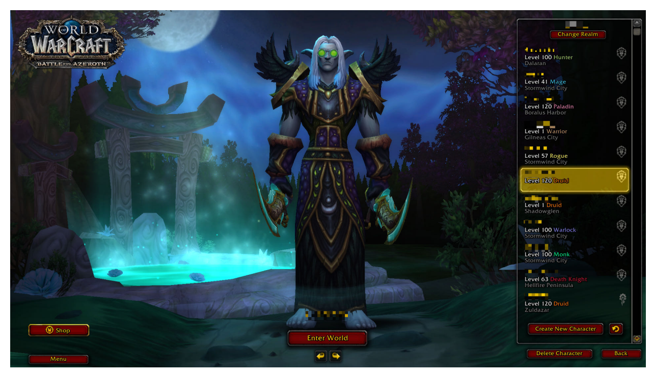
Figure 3: My virtual representation within WoW. Note that those are armored shoulder pads, not actual wings.

was happened a few weeks into playing, as my druid left the forested "island" starting zone of Teldrassil and moved to the Darkshore region across the bay by boat to continue various quests. I had travelled relatively far inland and finally needed to return to the capital city in Teldrassil, which I did by taking a "taxi" — meaning a flying mount in the form of a half-eagle/half-lion griffin — much more efficient and faster than travel on foot.