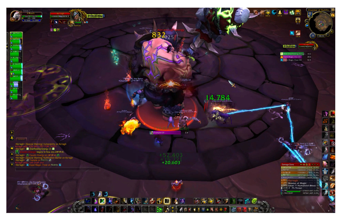
Figure 8: Screenshot of a typical raid boss battle. Note the green bars on the left indicating the group members' health. A third-party modification called "Recount" is located in the lower right corner that displays a comparison of damage output by each member.

that has a series of patterned attacks that can be, with practice and research on strategy guides online, anticipated and countered in order to defeat the creature and gain material rewards for their characters. To be successful, battles involve close coordination and communication among participants. Everyone needs to understand what special attacks the boss has at its disposal, and at what point during an encounter they occur (monster attacks are to a certain extent scripted affairs). Because some of these attacks affect an area of the room, rather than specific targets, placement and movement of characters is also essential for success. Therefore, boss fights involve coordinating movements and actions that are comparable to micro-practices in a ritual