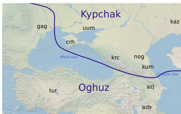
Figure 1: Location of Turkish (tur) and Crimean Tatar (crh) within the Black Sea area.

Turkish is the official language in Turkey, and an official language in Cyprus. It is a recognized minority language in Greece, Iraq, Kosovo, Macedonia and Romania. There are around 80 million fluent speakers of Turkish, mostly living in Turkey (Eberhard et al., 2019). Crimean Tatar is a recognized minority language in Ukraine and Romania. There are over half a million speakers of Crimean Tatar, who mostly live in the Crimean peninsula, Uzbekistan, Turkey, Romania, and Bulgaria (Eberhard et al., 2019). The map in Figure 1 shows the two languages' situation among other Turkic languages spoken around the Black Sea.