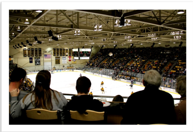
Tech alumni from far and wide reunite in the Husky Suite South Skybox at the ME-EM Alumni Hockey Social.

Visit the registration link on the Michigan Tech website for more information and to purchase tickets, or contact the Alumni Services office (906) 487-2400.