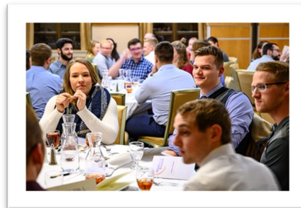
New ME alumni attending the Fall 2019 ME-EM Senior Banquet & Order of the Engineer Ceremony held December 10, 2019 - See more Photos from the event.