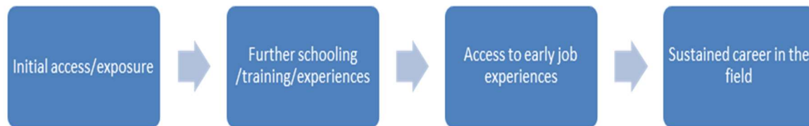
Figure 1: General Model of a Traditional Career Pipeline

programming, visual and audio art and production, game and level design, writing, user-experience and user-interface research and design, and localization.