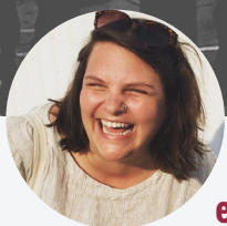
founder & executive director

operates with a lean staff and low overhead. Our efforts are making a profound and measurable impact on parole and prison justice in New York State because of the generosity and collaboration of our volunteer corp, pro-bono lawyers, in-kind donors, funders and partner organizations.