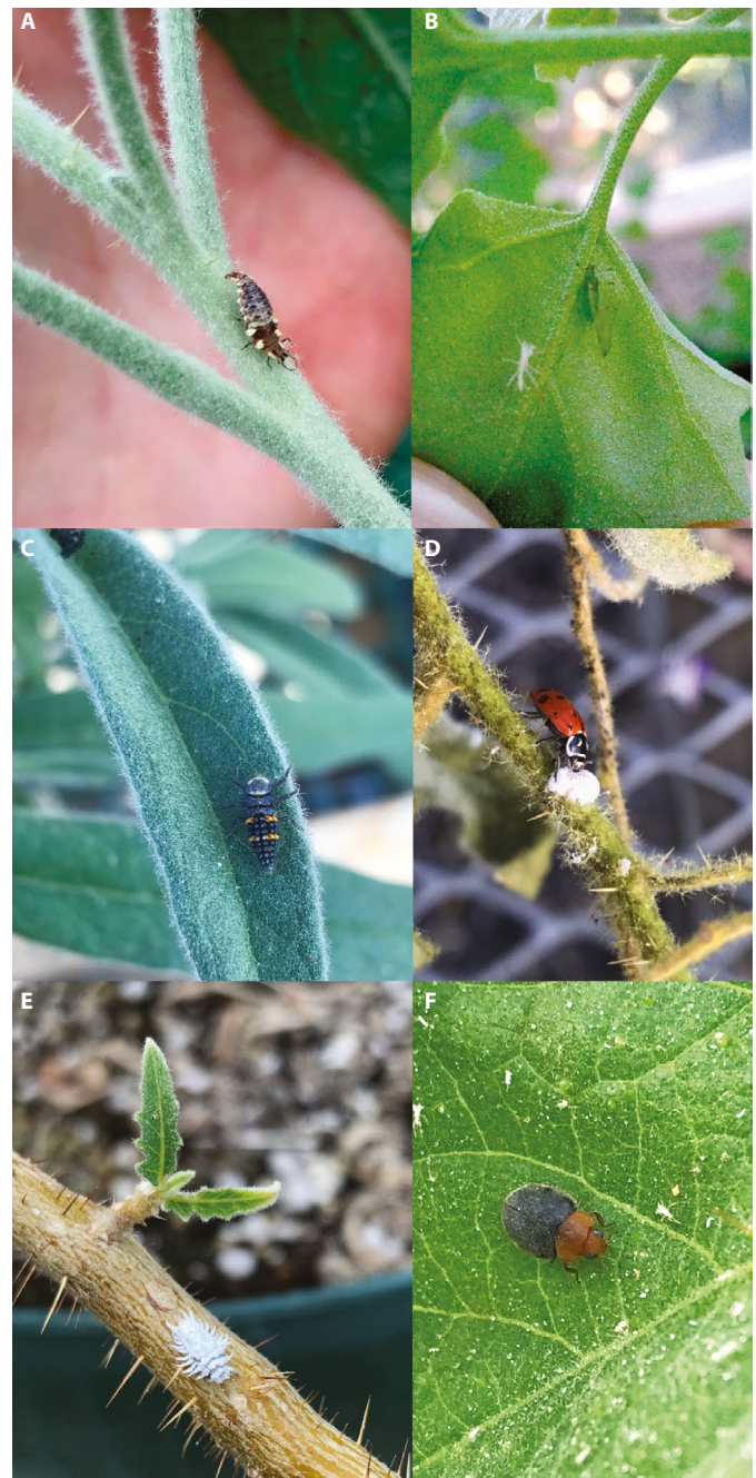
FIGURE 1. Three of the most common predatory insects in our standing IPM order used to help control aphids and mealybugs, two of the primary pests of greenhouse-grown Solanum . (A, B) Green lacewing ( Chrysoperla rufilabris ) larval and adult stage (adult recently emerged). (C, D) Ladybird beetle ( Hippodamia convergens ) larval and adult stage (adult preying on mealybug). (E, F) Cryptolaemus montrouzieri larval and adult stage.

Two ladybird beetles, Coccinella septempunctata L. and Hippodamia convergens Guérin-Ménéville (Fig. 1C, D), have been used in conjunction with both gall midges and lacewings as another cost-effective, quick-acting beneficial insect (Tables 1, 2). Released as adults, ladybird beetles are highly effective as a long-term, multi-generation approach to aphid control. Adults have been observed preying on aphid populations within minutes of release. Ladybird beetle populations are often maintained at low levels through sustained sexual reproduction, as evidenced by the presence of larvae