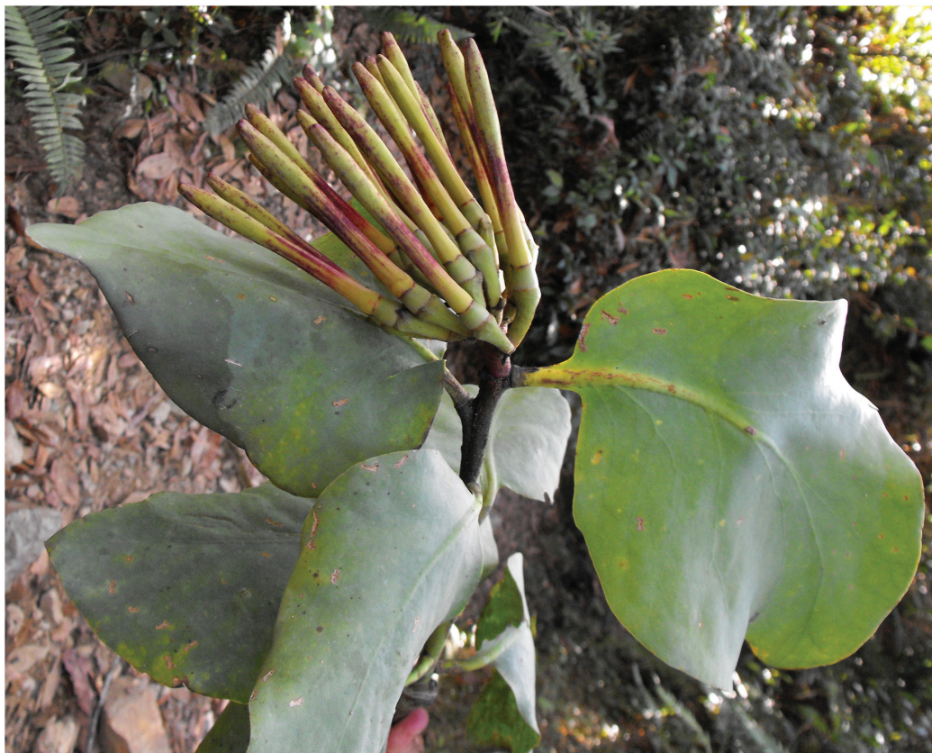
Figure 2. Psittacanthus longirectus Roldán & Alzate. Plant specimen (from Urrao, Antioquia, Colombia), showing the erect habit, the large and erect leaves, and reddish-green flowers