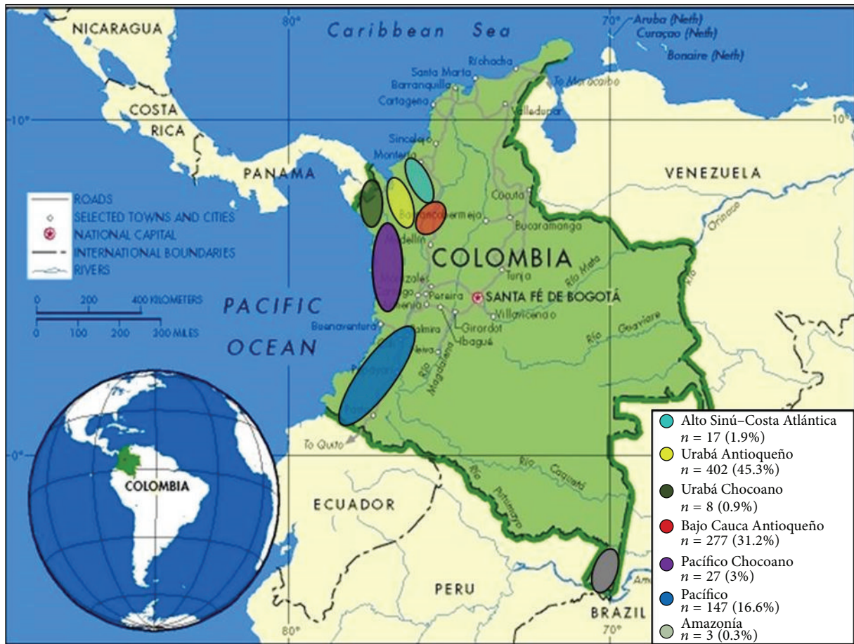
FIGURE 1: Geographical location of patients' residence by Colombian malarial endemic regions. Obtained and modified from the Cartographic Design Unit of the World Bank, 2000.