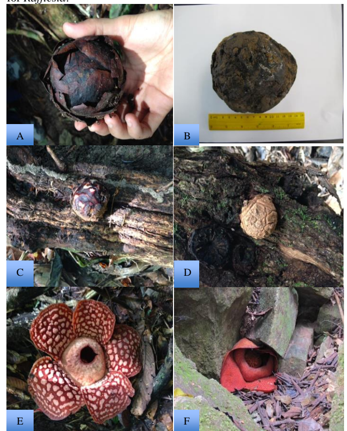
Fig. 3: A) Rafflesia cantleyi [Bract stage], B) Unripe fruit of R. cantleyi , C) Rafflesia cantleyi [Cupule-bract stage], D) Rafflesia cantleyi [Cupule stage], E) Rafflesia cantleyi bloomed at Sg. Gadong 1 [Anthesis stage], F) Rafflesia kerri bloomed between the rocks at Sg. Kooi [Anthesis stage]

Field survey also noted that more buds grew on bigger host plant. Some buds hang like a shower from the vines of the host plant. Besides, it was found that the number of Rafflesia buds increases with the class size for host-plant of Rafflesia with coefficients of determination of R^2=0.9866 . When the host plant is bigger in size, the more nutrients it contained and this meant more Rafflesia population on the host plants' vines. Moreover, bigger sized host plants can accommodate the naturally big and heavy Rafflesia mature buds and flowers. During field survey, it was also noted that smaller sized host plants tend to break or damaged before the buds reach maturity period and this lower the chances of survival for Rafflesia .