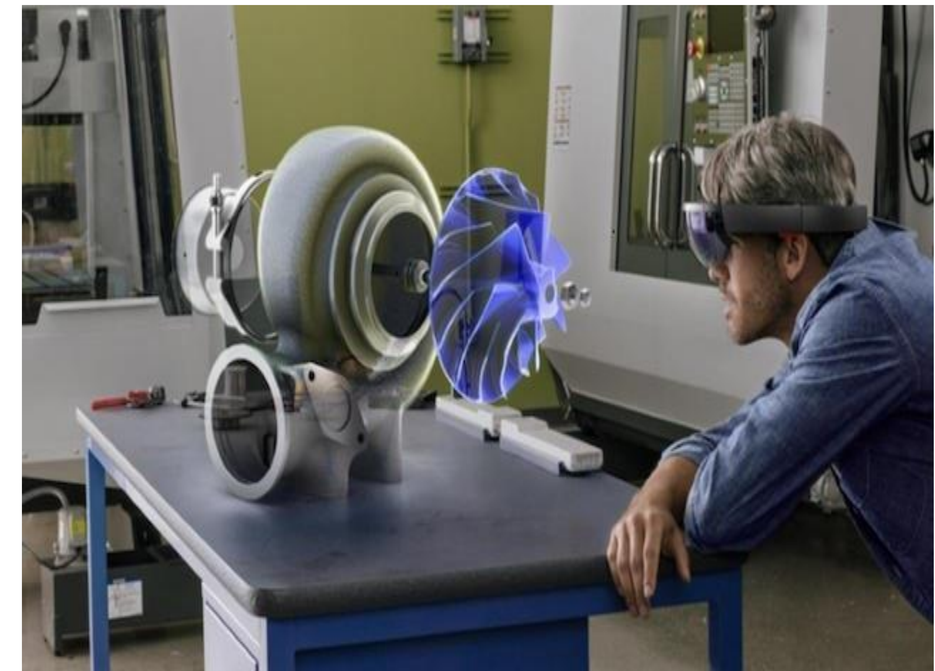
Microsoft HoloLens displaying augmented reality engine compressor.

Where the traditional learning model leans heavily on memorization and discipline to create uniform, self-reliant students, the educational system must shift the focus from what students learn to how well students can apply knowledge to break barriers, chart their own paths and ignite their own career passions and interests. As we redefine the education environment through technology and innovative learning styles, we can prepare students to meet changing workplace expectations by teaching them how to learn, think and lead.