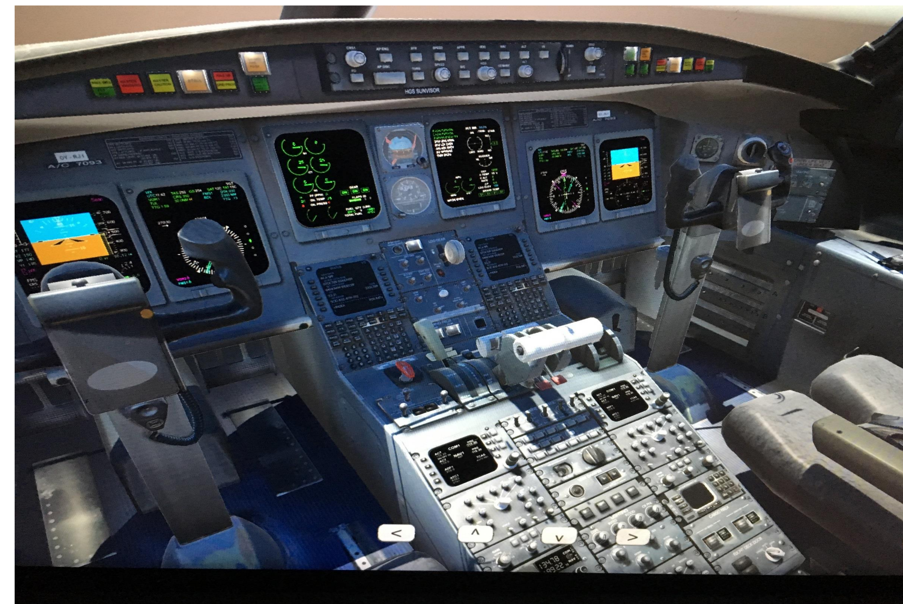
WMU augmented reality Jet viewed in augmented reality.

The pedagogical material development has been extended to outreach activities and integrate AR micro-simulations in the classroom as interactive 3D knowledge objects. Using Bloom's Taxonomy in the cognitive domain, 3D learning objectives can be refined to create more meaningful student outcomes and mapped to reflect expected assessment and student proficiency in technology driven training environments.