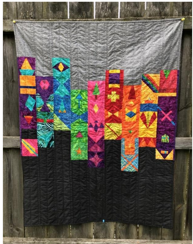
Figure 4. “40 Trinket Blocks,” by Lynne Hall.

The quilting guilds of today are equivalent to the quilting bees of the past where women would gather together for socialization and community building (Howell & Pierce, 2000). Every year, quilting enthusiasts gather for QuiltCon, the largest modern quilt show and conference in the world. QuiltCon participants are eager to learn the latest trends in quilting. Last year, modern quilts took center stage. “Modern quilts have so much meaning,” said Lynne. She remembers one particular quilt with the word “poverty” stitched across the front in very large letters. “You could not see what it said up close, you had to back away,” she said. “It was as if the quilt was saying poverty is right in front of your face, but you do not see it.” Lynne believes the Internet has created several exciting networking opportunities for the quilting community. In 2019, she created the quilt “40 Trinket Blocks” (see Figure 4) during a worldwide online sew-along on Instagram. Social media platforms have made it easier for quilters to learn new skills and connect with others who share the same interests.