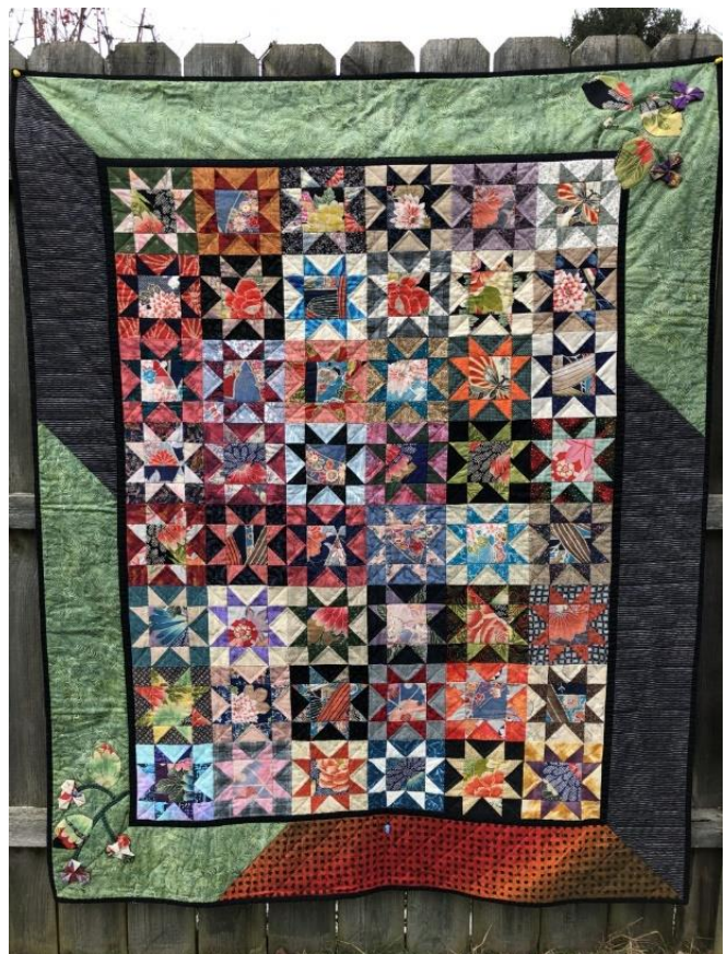
Figure 3. “Japanese Stars,” by Lynne Hall.