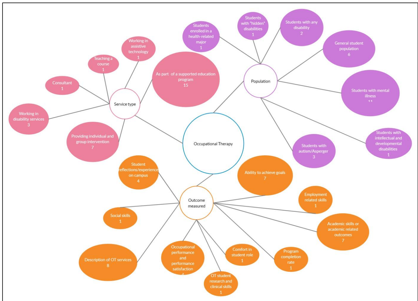
Figure 2. Visual representation of occupational therapy service type, population served, and outcomes measured.

Article limitations. Although the purpose of the scoping review was a mapping exercise and not a judgment of rigor of included articles, there were a variety of limitations noted. Most of the articles were descriptive in nature without a strong focus on outcomes data from intervention (Best et al., 2008; Burnett-Beaulieu, 1984; Burnett & Yerxa, 1980; Burson, 2003; Eichler et al., 2015; Eichler & Royeen, 2016; Gutman & Schindler, 2007; Nolan & MacCobb, 2006; Smallfield et al., 2011). Other articles were limited by a small sample (Berg et al., 2017; Gutman et al., 2009; Gutman & Schindler, 2007; Gutman et al., 2007; Jacobs et al., 1996; Keptner et al., 2016; Keptner, 2017; Lewis & Nolan, 2013; McCausland et al., 2012; Quinn et al., 2013; Schindler et al., 2015). Of those that measured outcomes following an intervention, eight lacked a control group (Best et al., 2008; Gutman et al., 2007; Keptner et al., 2016; Keptner, 2017; Schindler et al., 2015; Schindler, 2014; Schindler, 2018; Schindler & Sauerwald, 2013). For two studies, there was a lack of established reliability and validity for several outcome measures (Gutman et al., 2009; Gutman et al., 2007).