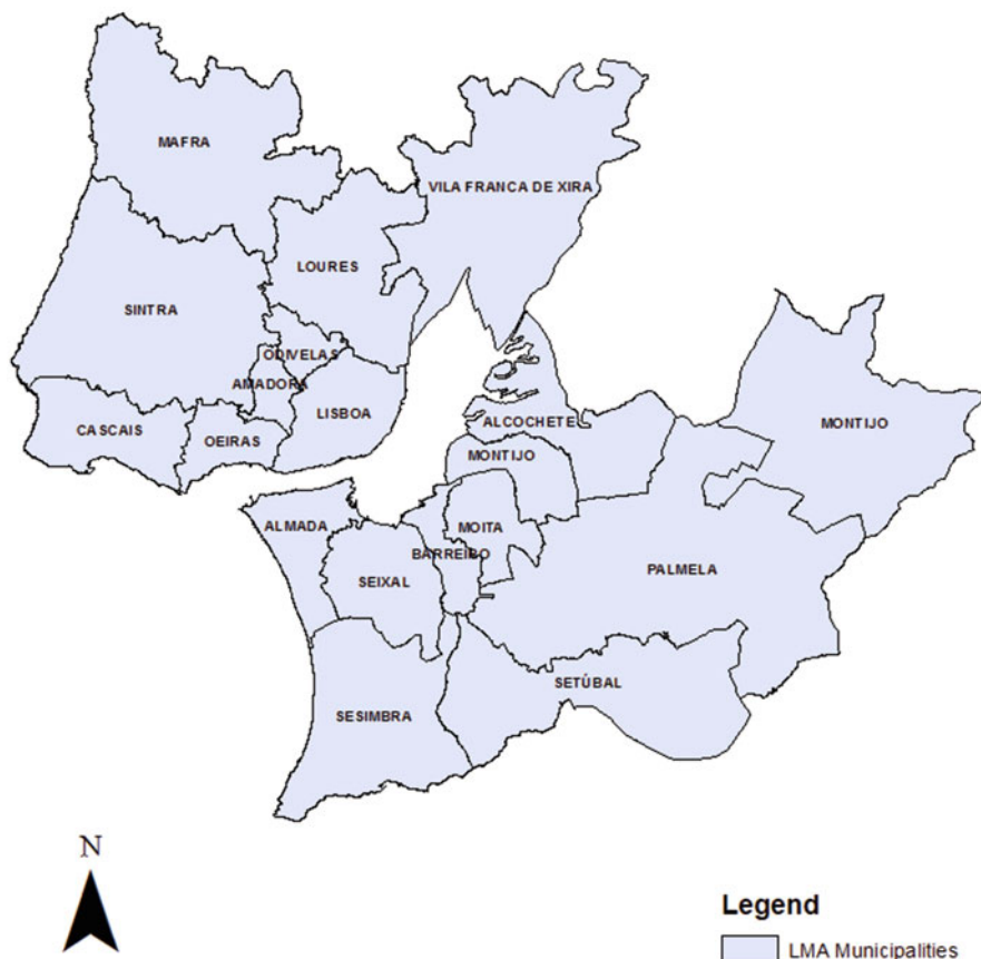
Fig. 7.1 Lisbon Metropolitan Area (LMA)

the 1960', with flows coming essentially from rural areas, the immigration dynamic of the 1970s and the 1980s is mainly related to the population of the ex-Portuguese colonies, which occupied the first peripheral crown of Lisbon. According to a recent characterisation of LMA with planning purposes (Regional Coordination Commission of Lisbon and Tagus Valley [CCDR]), this is a polarised territorial entity with an influence that exceeds its administrative borders, explained by, and among other factors, the improvement of transport infrastructures (CCDR 2009: 33). LMA is the location of multinational enterprises and several industrial activities, especially in the South bank of Tagus River. It is the most competitive economic center of the country (38.6% of National GDP) (CML 2012) with global integration and a strong presence in international markets. This is also a territory with problems like the lack of land use planning, urban and landscape disqualification, mobility, environmental risks, social exclusion and inequality (Figs. 7.2 and 7.3).