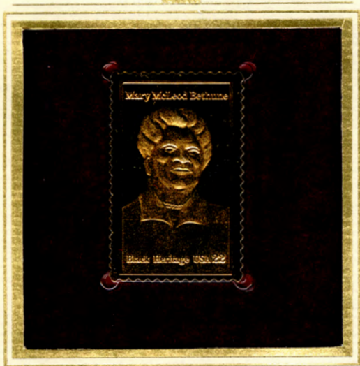
Mary McLeod Bethune Black Heritage Series