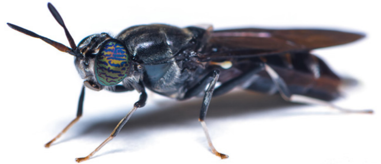
Black soldier fly

Questions that the researchers aim to answer include 'how can we define insect welfare in terms of health and behaviour?', 'what is the moral status of insects?', 'what housing conditions are appropriate for large-scale rearing of flies?', and 'what risks can adversely affect the short- and long-term economic