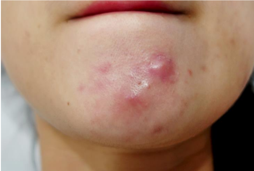
Figure 4: An Example of Cystic Acne:

https://optinghealth.com/wp-content/uploads/2017/07/Cystic-Acne-1-e1503829566899.png