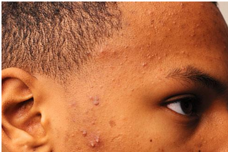
Figure 2b: Moderate Acne:

https://www.webmd.com/skin-problems-and-treatments/acne/ss/slideshow-acne-dictionary