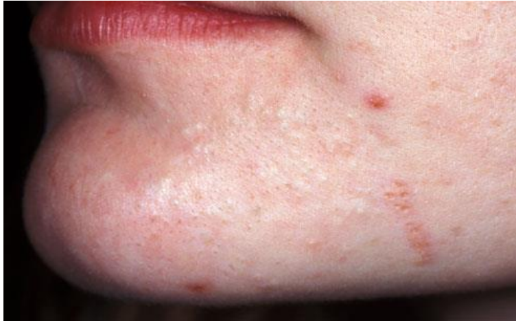
Figure 2a: Mild Acne:

https://www.webmd.com/skin-problems-and-treatments/acne/ss/slideshow-acne-dictionary