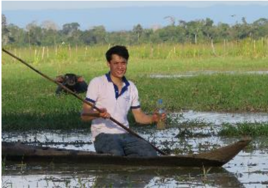
Figure 4. The Ramsar-listed Beung Kiat Ngong wetlands in Champasak Province are known to be fed by groundwater.

Safeguarding access to clean water: Rural water supplies largely depend on groundwater sourced from wells and springs. Yet a significant proportion of the population still lacks access to safe and clean water for domestic use and sanitation largely due to inadequate infrastructure development (Fig. 5). Groundwater using appropriate infrastructure, like protected wells, is a viable source for closing the gap in water supply and sanitation in rural areas. Increasingly, groundwater could also play a significant role in urban areas.