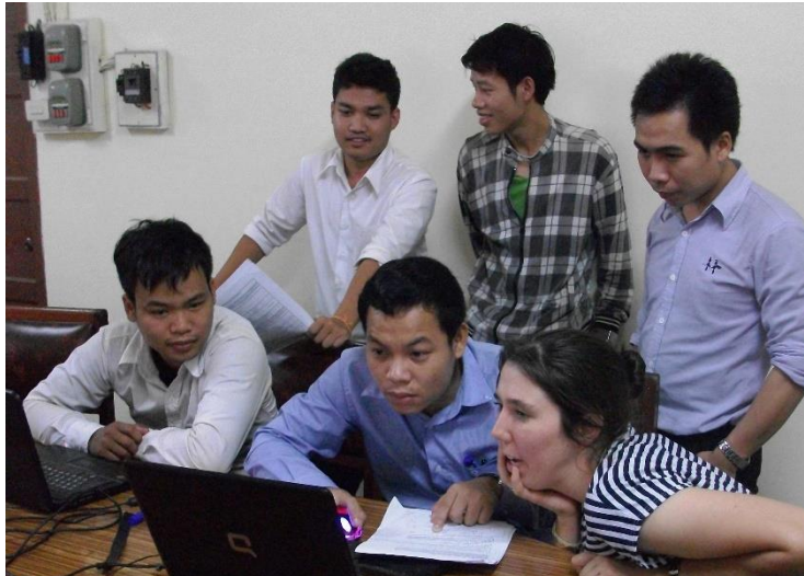
Figure 3. Bachelor students from the National University of Laos and an intern from Australia interacting during training activities.