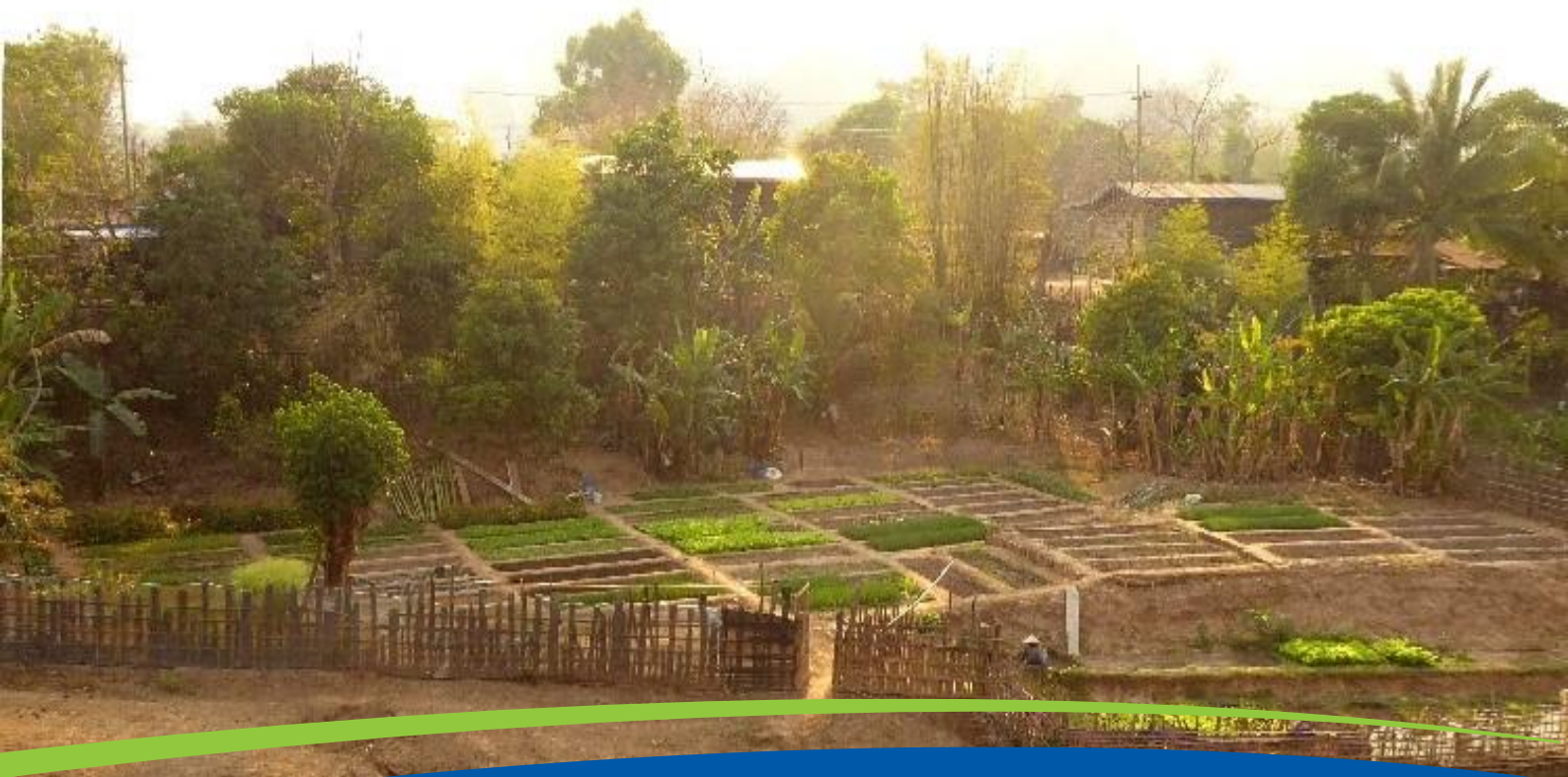
Photo: Gardens irrigated with groundwater in Southern Laos