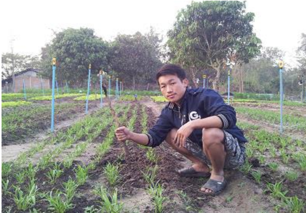
Figure 6. A BSc student from FWR participates in field research at the experimental facility located on Tad Thong campus in Vientiane.