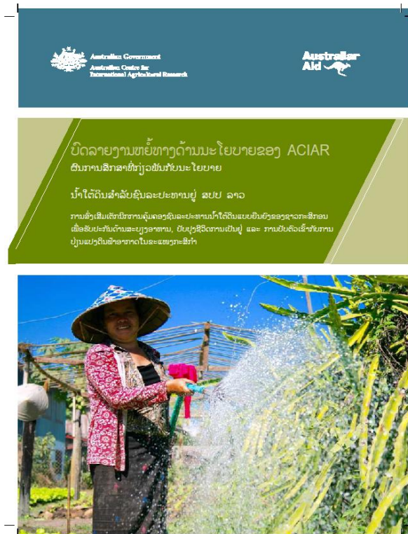
Figure 8. Policy brief on groundwater for irrigation, Lao version (ACIAR 2017)

It is perhaps useful to note that the project took place at a time when groundwater was beginning to receive broad recognition in the country. Before the project, national policy documents on water resources and climate change made scant reference to groundwater. Over the course of the project, groundwater received its first-ever explicit inclusion in the country's 5-year national socioeconomic development plan (the 8 th plan for 2016-20), and it was also featured in the revised Water Laws finalized in 2017.