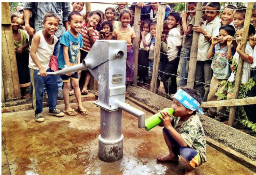
Figure 5. Improved water supply from groundwater in a Lao village ensures the basic human right to clean water

Safeguarding access to clean water: Rural water supplies largely depend on groundwater sourced from wells and springs. Yet a significant proportion of the population still lacks access to safe and clean water for domestic use and sanitation largely due to inadequate infrastructure development (Fig. 5). Groundwater using appropriate infrastructure, like protected wells, is a viable source for closing the gap in water supply and sanitation in rural areas. Increasingly, groundwater could also play a significant role in urban areas.