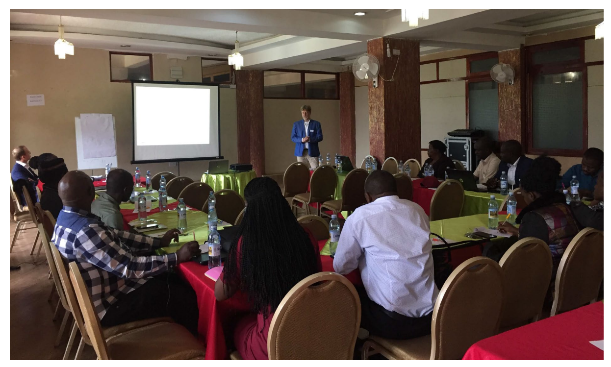
Impression of the workshop on Friday 18-10