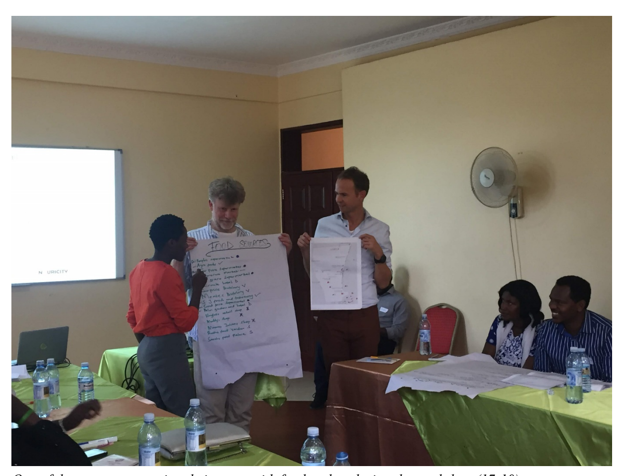
One of the groups presenting their maps with food outlets during the workshop (17-10)

During the workshop, we randomly divided the group into 4 subgroups. We provided each subgroup with a map of the area to map their urban food system. The overlay of the four maps provides an overview of the different retail points, markets, supermarkets and some restaurants in Kanyanya. The 4 maps in Figure 1 below present the different maps drafted by the groups of participants. The maps partly overlap. When we make an overlay, it will result in a more complete map with food outlets in Kanyanya.