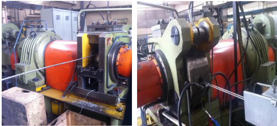
Figure 3. Machine of continuous extrusion "Conform"