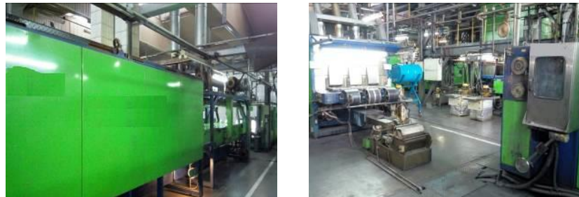
Figure 5. Aggregate for wire drawing

Wire drawing to a diameter of 0.5 mm using the wire drawing method carried out according to the serial technology of an industrial enterprise on the drawing machine (Fig. 5). Filling the billet with a diameter of 2.65 mm on the drawing machine carried out by pulling along a standard drawing route with a single crimp of about 20%, and the output was wound onto a cylindrical coil using L71-03 technological lubricant.