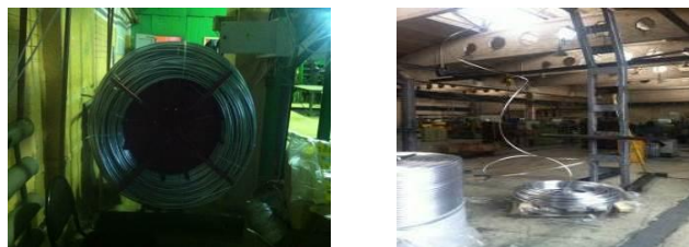
Figure 1. Experimental coil of alloy cast using EMM

A continuous cast billet with a diameter of 12 mm from an experimental alloy (Fig. 1) obtained in an electromagnetic mold on the equipment of «RPC Magnetic hydrodynamics» LLC (Krasnoyarsk, Russia) and coiled into the bay (Fig. 1).