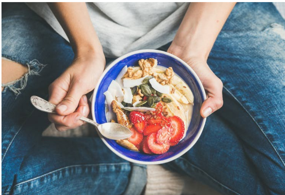
Developing new healthier habits can take time and perseverance, but will pay off.

However, the paleo diet also excludes two major food groups – grain and dairy foods.