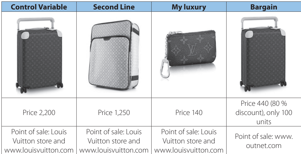
FIGURE 6: Images of different stimuli

a traditional item with a regular price and regular distribution channel was included. The same stimulus of the control condition was used as an aspirational scenario to ascertain the future expected relationship of the survey participants with the brand. They were randomly assigned to three different conditions.