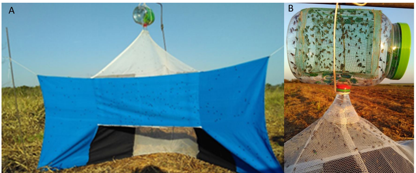
Figure 2. Nzi trap (A) with a large screened collector (B) used for catching Stomoxys calcitrans for field insecticide bioassays.

The three wild stable fly populations evaluated in this study were resistant to cypermethrin, with RFs ranging from 6.8 to 38.6 (Table 1). Resistance of stable flies to insecticide classes has been previously reported for organochlorines, organophosphates and pyrethroids in the U.S. and some European countries (KUNZ & KEMP, 1994). Pyrethroid resistance in field populations has been confirmed in the U.S. (CILEK & GREENE, 1994; PITZER et al., 2010) and France (SALEM et al., 2012), and there is evidence of its occurrence elsewhere (EHRHARDT, 2006). To the best of our knowledge, this is the first report of insecticide resistance in stable flies in Latin America. The detection of stable fly resistance revealed a high selection pressure by pyrethroid insecticides at the study sites, which is particularly concerned because Midwestern Brazil is home to the country's largest cattle herd (IBGE, 2016)