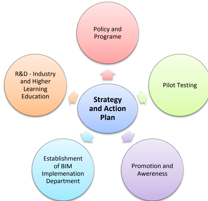
Figure 4: Strategy and Action Plan for Implementing BIM in Hong Kong (Andy et al., 2011)