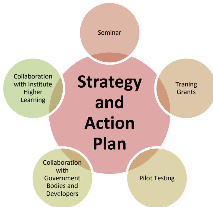
Figure 3: Strategy and Action Plan for Implementing BIM in Singapore (Evelyn and Fatt, 2006)