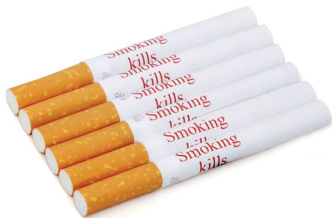
Figure 1. Warning on cigarettes.

to respond to questions at the start of each group, they were informed that their views may differ and when answering they should not be influenced by anyone else within the group or the interviewer(s). Groups typically lasted 90 minutes, after which participants were debriefed about the study and received an incentive fee (£25). Ethical approval was obtained from the Ethics Committee of the School of Management at the University of Stirling.