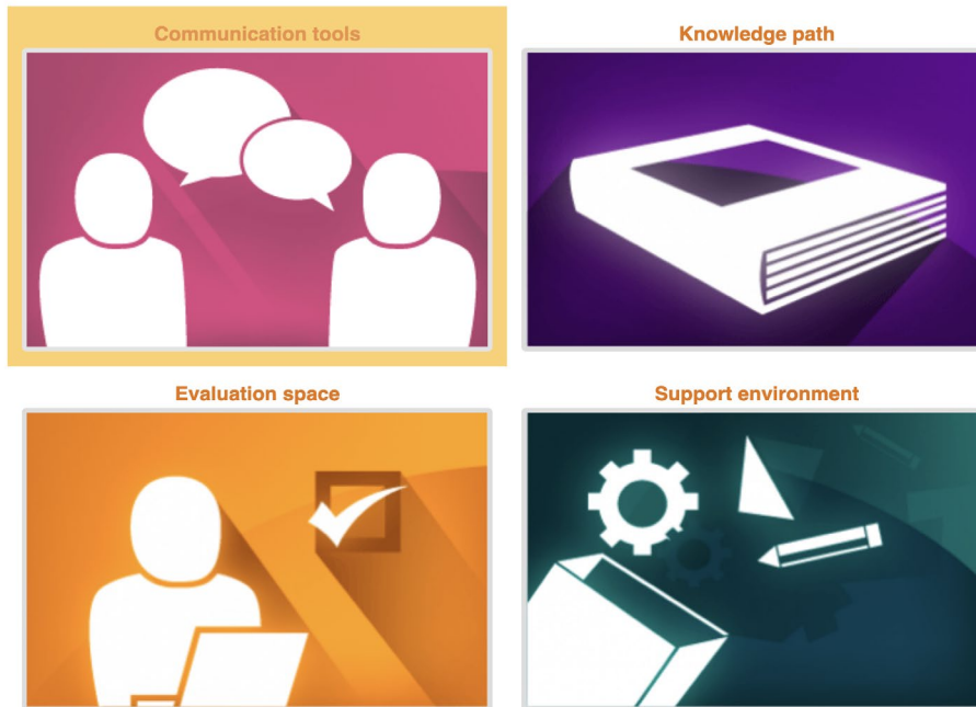
Figure 2. Environment for Moodle courses

The University of Atlántico has improved its infrastructure, creating the institutional conditions for integrating ICT. One of the tools provided is the SICVI 567 platform (Moodle). We are continuously working on its improvement, for example, its interface, task automation, and safety. In the near future, the institute plans to present the MOOC-UA platform, also based on Moodle for the distribution of MOOCs, in conjunction with the IT Department through the Virtual Education Project and supported by the Faculty of Education Sciences.