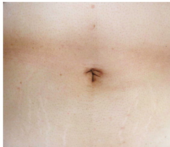
Fig. 3. Photograph of the umbilical wound site three months after single-port laparoscopic surgery The umbilical wound healed three months after the operation.

This is a rare case of acute torsion of a subserosal uterine fibroid, diagnosed preoperatively, and successfully managed by single-port laparoscopic surgery. To the best of our knowledge, this is the first report of single-port laparoscopic myomectomy under pneumoperitoneum for torsion of a subserosal