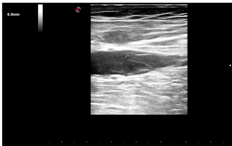
Figure 3. Ultrasonographic femoral scan. The exam showed in situ thrombosis of the left femoral vein which was not compressible with the probe.