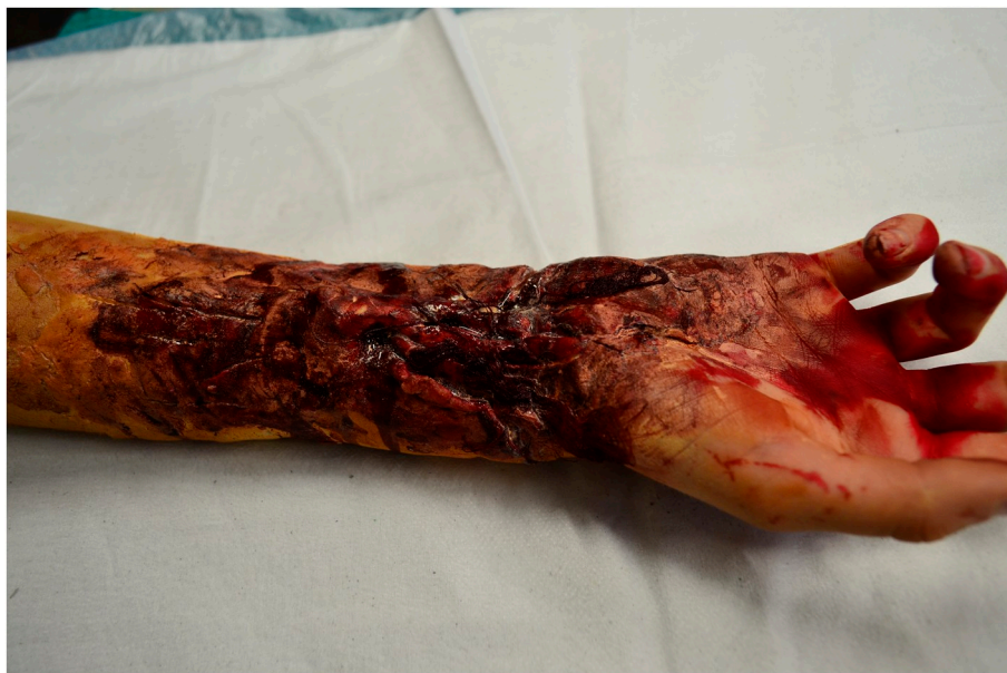
Fig. 2. Examples of low-cost moulage for a simulated bandaging practical.

A pilot study is one of the recommended techniques for addressing reliability and validity of a questionnaire [9]. The process of performing the pilot study for this research is described in Appendix One. Data from the Likert-type questions were imported from SoGoSurvey® into an Excel® (Microsoft Office, Microsoft Corporation, Redmond, WA) file and analysed descriptively using frequency and percentage responses to