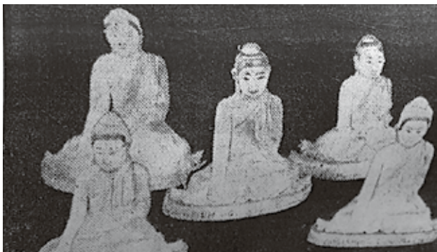
Figure 2 - U Hla's donations of Buddha images to Japan

After donating the Buddha images, U Hla said: