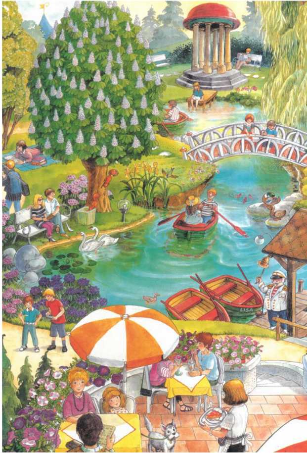
Figure 2. Prompting board activity. [Colour figure can be viewed at wileyonlinelibrary.com ]

the child's upbringing to fill out the questionnaires. SES was operationalised as parental education. Participating dyads were divided into three categories (Table 1). The lowest includes parents who attained secondary education (up to 18 years of age). The middle category represents parents who attained lower level tertiary education: vocational education preparing for occupations such as mechanic or nursing assistant. The highest category includes parents with a college or university degree. Compared with the Dutch population, higher educated parents are overrepresented in our sample (Central Bureau for Statistics, 2018): 30.4% of the population are low educated, 28.8% middle educated and 29.5% high educated.