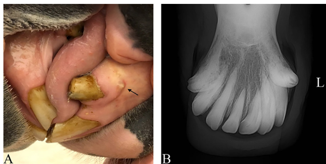
Figure 3 (a) Representative photograph of horse 13 showing a small draining tract (arrow) on the gingival surface of tooth 304. Mild bony swelling of the gingiva is also evident. (b) Intraoral radiograph of the mandibular incisor and canine teeth of horse 13 demonstrating hypercementosis and resorptive lesions of varying degree in teeth 301, 302, 303, 403 and 404 (the lesions appear mild relative to those presented in figure 1). L, left.

It has already been established that EOTRH is a disease that primarily affects the teeth of older horses. The horses in most of the previous reports have been older than 15 years when first presented, 2 5 9 which is in agreement with our observations. However, one recent study noted that age is not a significant risk factor, 4 and Smedley and others 5 describe pathological manifestations of the disease in a 10-year-old horse. This is supported by radiographic evidence of resorption in even younger horses, although the frequency of all types of tooth resorption does increase significantly with age. 1 8 Most of the horses in the study had severe