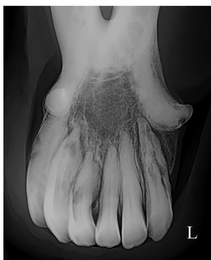
Figure 1 Intraoral radiograph of the mandible of horse 19 showing hypercementosis and resorptive lesions in teeth 302, 303, 304, 401, 402 and 403. Hypercementosis predominates in the teeth on the right side, whereas resorption is more evident on the left side. L, left.

The triadan 03 teeth were most commonly affected, followed by the triadan 02 teeth. The resorptive lesions within the teeth were most frequently located in both the apical aspect and the reserve crown (91/190 affected teeth), followed by the apical aspect (59/190 affected teeth) and the reserve crown (31/190 affected teeth).