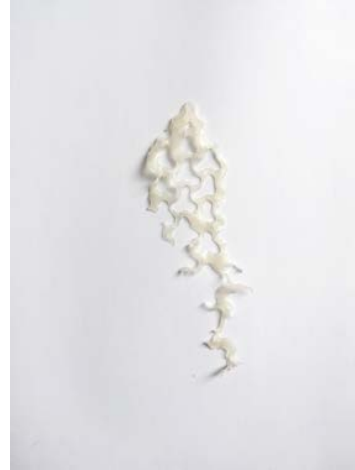
Figure 3 (left): Visual communication of cellulose dissolution in edited scientific microscope picture. Figure 4 (right): Cellulose film experiments in design studio