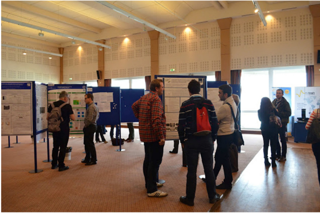
A view of the poster session