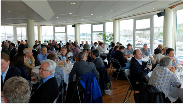
Lunch in the Jacques Cartier Rotunda