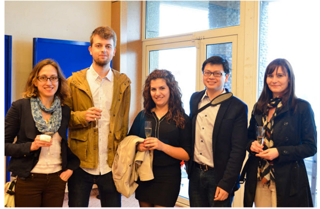
Students in the Meeting staff