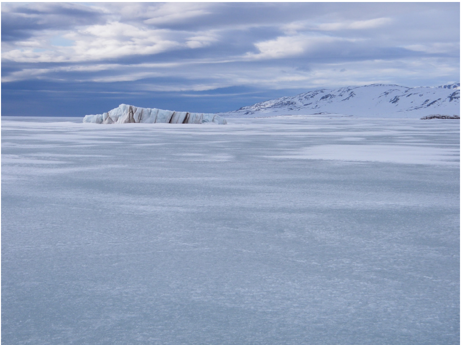
Figure 1: Landfast sea ice in Kongsfjorden in spring 2009, with an iceberg in some distance.

Landfast sea ice covers the inner parts of Kongsfjorden, Svalbard, for a limited time in winter and spring months, being an important feature for the physical and biological fjord systems (Figure 1). Systematic fast-ice monitoring for Kongsfjorden, as a part of a long-term project at the Norwegian Polar Institute (NPI) was started in 2003, with some more sporadic observations from 1997 to 2002. It includes the ice extent mapping and in situ measurements of ice and snow thickness, and freeboard at several sites in the fjord. The permanent presence of NPI personnel in Ny-Ålesund Research Station enables regular in situ fast-ice thickness measurements as long as the fast ice is accessible. Further, daily visits to the observatory on the mountain Zeppelinfjellet close to Ny-Ålesund, allow regular ice extent observations (weather, visibility, and daylight permitting). Data collected within this standardized monitoring programme have contributed to a number of studies. Monitoring of the sea-ice conditions in Kongsfjorden can be used to demonstrate and investigate phenomena related to climate change in the Arctic.