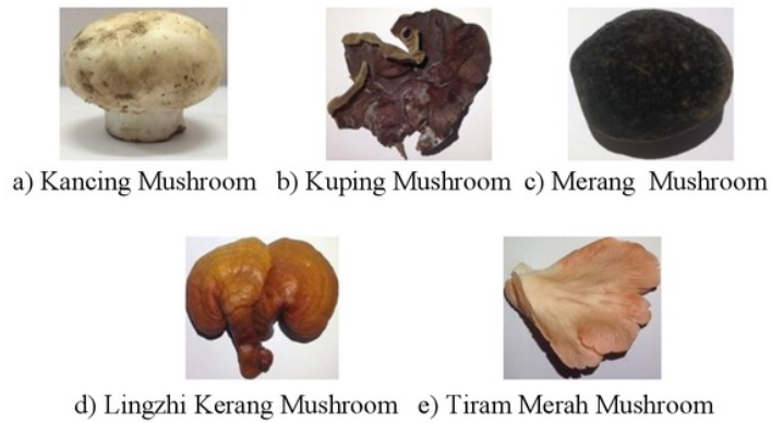
Figure 1. Image of mushroom Identification

Entropy [4]. The use of technology is so great that computers can work by mimicking the workings of the human brain by utilizing artificial neural network methods [5]. Classification technique used by Artificial Neural Networks with Backpropagation Algorithm. Artificial Neural Networks trains the network to get a balance between the ability of the network to recognize patterns used during training and the ability to respond correctly to input patterns similar to the patterns used during training [6]. As for this study, the type of fungus that will be identified is Kancing Mushroom, Kuping Mushroom, Merang Mushroom, Lingzhi Kerang Mushroom, and Tiram Merah Mushroom.