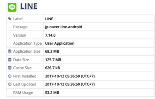
Figure 6. LINE messenger data extraction in MOBILedit

From data extraction log, it is clearly different in the duration of the process. In the first test as seen in Figure 7 (a), data extraction completed in 14 minutes 48 seconds. In the full content extraction, the process complete in 59 minutes 22