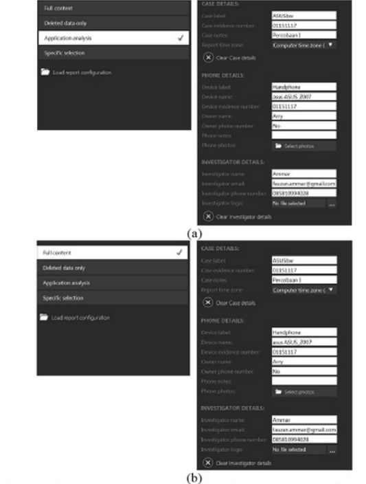
Figure 3. Screenshots of MOBILedit Forensic setting: (a)Test 1 (b)Test 2

MOBILedit is a forensic tool that allows investigators to logically obtain. This tool uses several connectivity