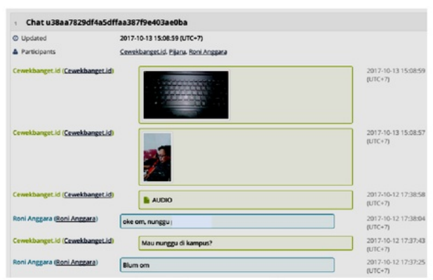
Figure 8. Text message artifact

In this test, some potential evidence has been acquired totally. The Android device contains LINE messenger artifact such as contact, text messages, picture, audio, and timestamps. Data acquisition on this test uses physical extraction because LINE messenger's data cannot acquire in logical extraction. Rooting on the device meant that the data obtained can be maximally extracted.