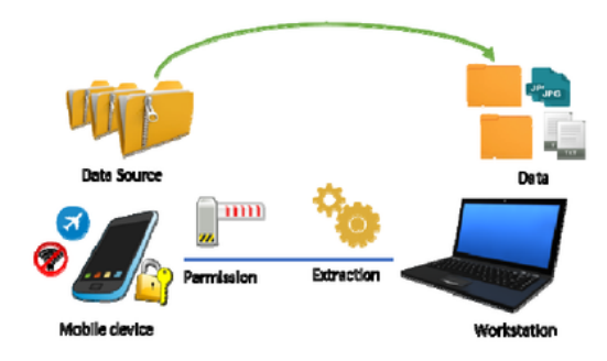
Figure 4. Data extraction process in mobile forensic

The purpose of this research is to gather digital evidence and identify them. The method is using two kinds of extraction techniques. MOBILedit has two kinds of this extraction: application analysis extraction and full content extraction. We want to analyze and identify the two different digital evidences from one forensic tool. Figure 4 show a simulation of data extraction process in the forensic tool.