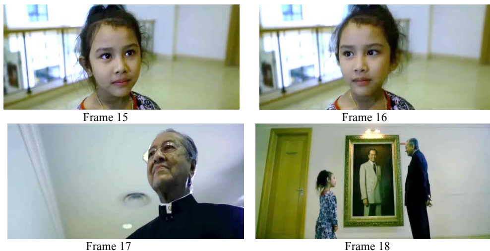
FIGURE 6. Return of a political icon

A total of four frames formed the conceptual roadmap on Tun Dr Mahathir through Aisyah at the art gallery. The four frames (i.e. Frame 15 to Frame 18) shown in Figure 6 are not scattered but are linked in sequence as in the short film.