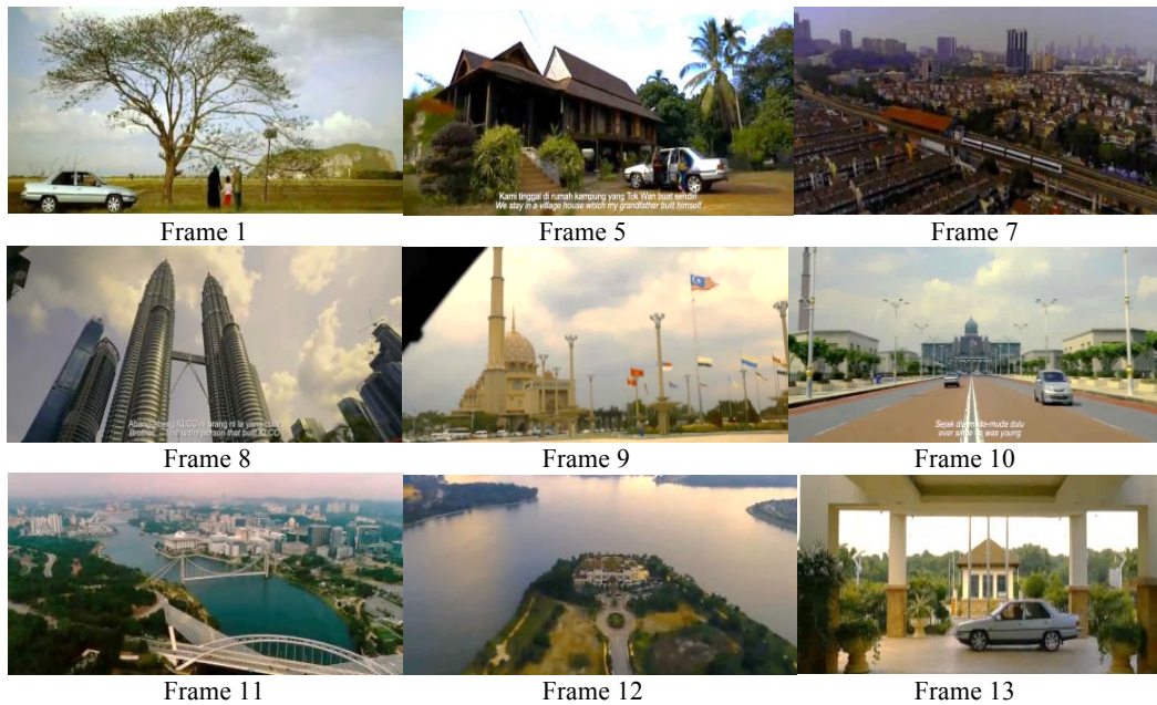
FIGURE 3. Father of modernisation

The first roadmap comprises a total of nine frames as shown in Figure 3.