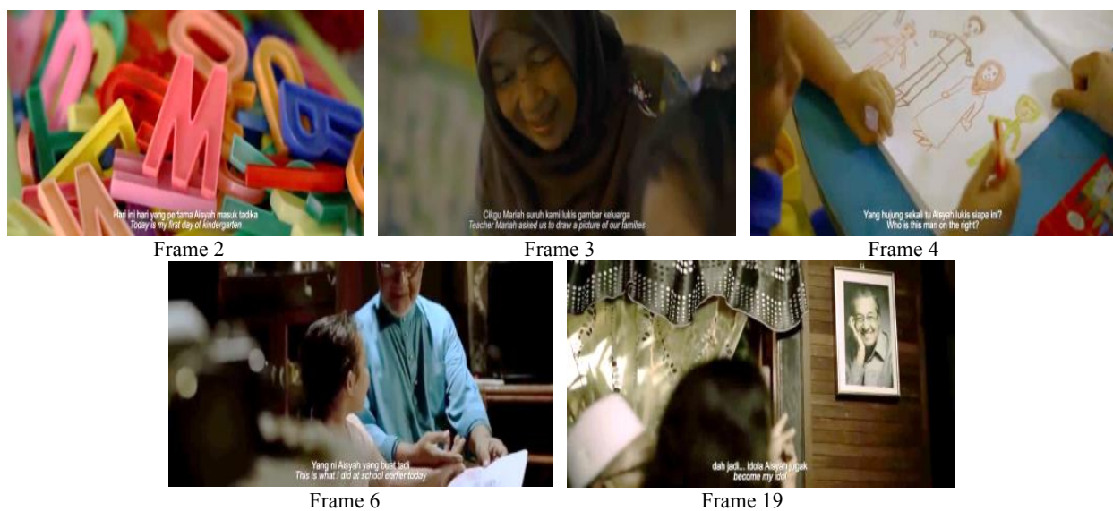
FIGURE 4. Popular prime minister across society

The images in Frame 2, 3, 4, 6 and 19 in Figure 4 consist of various ideas at different levels of society. All the five frames with still images and signs are analysed in consideration to the representation of Tun Dr Mahathir across society.