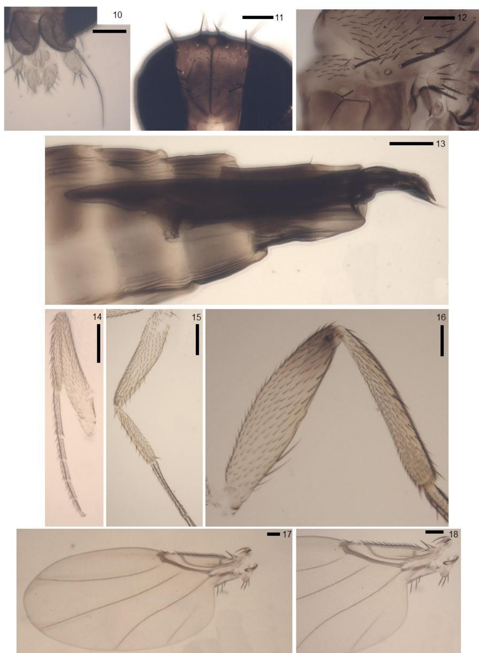
Figs 10-18 Imparphora pahangensis sp. nov. female. 10, postpedicels to proboscis; 11, frons; 20, side of thorax; 13, abdomen; 14, front leg; 15, middle femur to basitarsus; 16, hind femur and tibia; 17, wing; 18, basal half of wing. (Bar=100 \mu m).