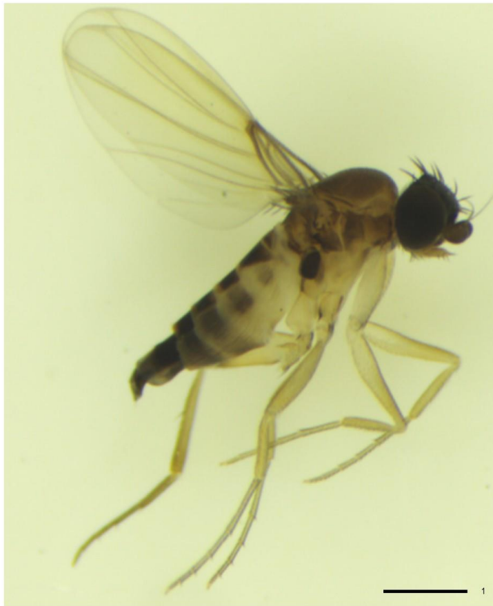
Fig. 1 Imparphora pahangensis sp. nov. female. (Bar=500 \mu m).