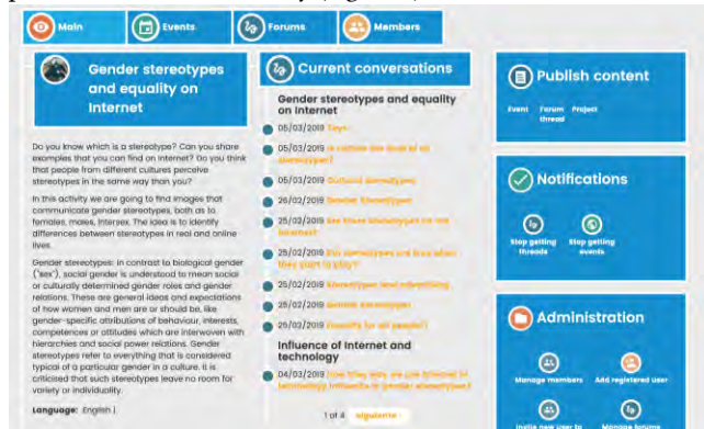
Figure 2: Community about gender stereotypes and equality on Internet inside the WYRED Platform

The international conversation chosen for this research is 'Gender stereotypes and equality on the Internet.' This activity has been developed around International Women's Day (March 8) and aims to share opinions and ideas about gender-related stereotypes on the Internet across Europe. To do this, participants shared all types of information (images, videos, news, etc.) related to stereotypes on the Internet, comment on the content added by other participants and discuss the different forum threads published in the community (Figure 2).