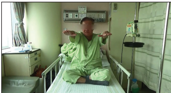
Video 2. After Intravenous Amantadine Treatment. Partial improvement of chorea involving the face, neck, and both the upper extremities and some restoration in gait and postural balance is observed. At follow-up interview on symptoms, the patient reported improvement in using spoon while eating and in gait.

emission tomography (PET) scan, decreased uptake in the bilateral striatum, especially in the caudate nucleus was obtained (Figure 1C). The anti-CV2/CRMP5 autoantibody was tested positive in a qualitative analysis using serum and cerebrospinal fluid mixture. Meanwhile, the diagnosis of small cell lung cancer with metastasis in the lymph node, first lumbar spine, and left ureter was made based on the malignancy workup.