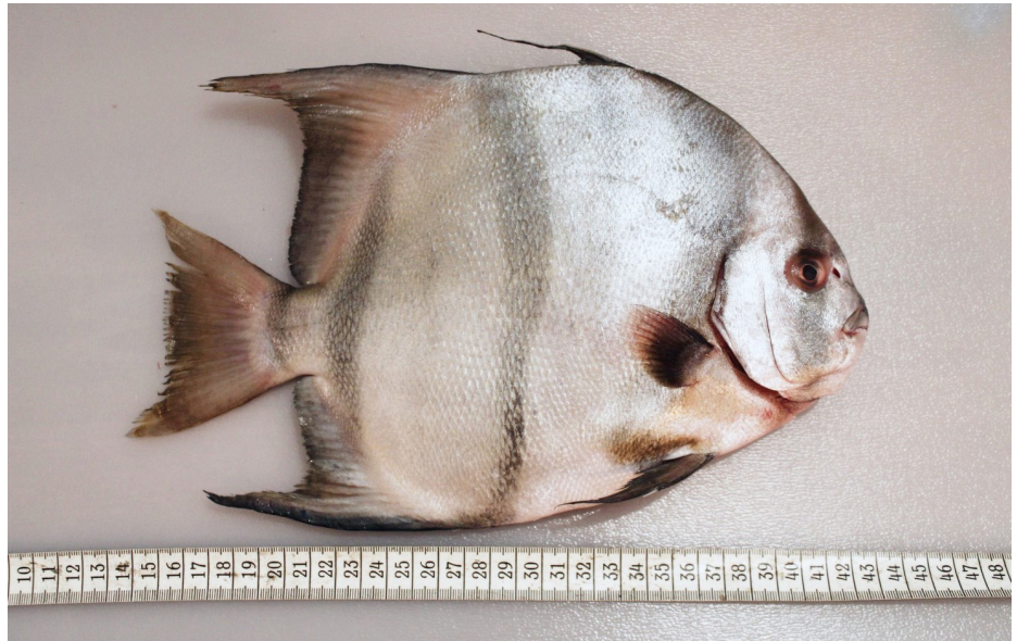
Figure 1. The Atlantic spadefish specimen captured in Argosaronikos Gulf by a small-scale fisher with nets and reported to the project “Is it Alien to you? Share it!!!”