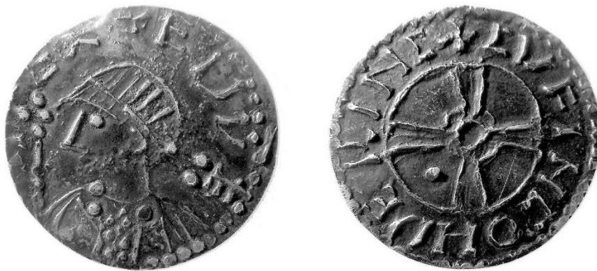
Figure 1: a rare specimen of a forged penny made during the Anglo-Saxon period, probably in the early/mid-1050s. It is modelled on Edward the Confessor’s Expanding Cross type, but – as with several other contemporary forgeries – the names of the moneyer and the mint-place on the reverse are nonsensical. This specimen was found at Cricklade, Wiltshire, and is recorded by the Portable Antiquities Scheme ( www.finds.org ) as WILT-21D084.

maintenance of the coinage and protection against forgery. Various currency crimes are singled out, from actually making counterfeit coin by imitating the name of another moneyer, to refusing good coin, passing on bad coin or being complicit in any such act. Provision is also made for those who are caught with bad money but claim that they did not know they were handling forgeries (ch. 7–7.2). The punishment fitted the crime, in that these wrongdoers would be required to ‘pay the penalty of their carelessness’ ( habeat ... dampnum illud ex incuria sua ) by exchanging their defective coins for others which are ‘pure and of good weight’ ( purum et recte appendens ), doubtless at a very unfavourable rate (see Figure 1).