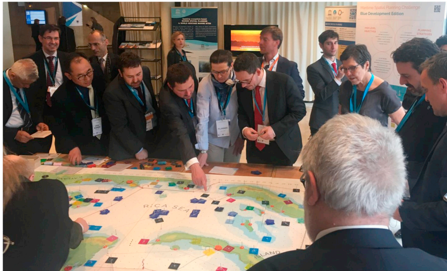
Fig. 1. Impression of the MSP Challenge warm-up board game session in Paris, March 2017.

Challenge's 'learning by doing', or 'learning by playing' approach is both enjoyable and informative for many participants. Although some find the gaming approach to public policy issues such as MSP challenging, there is no doubt that it has stimulated widespread interest and has received overwhelmingly positive reviews. Participants and observers appreciate the gaming format that creates a 'safe place' to develop a better understanding of: