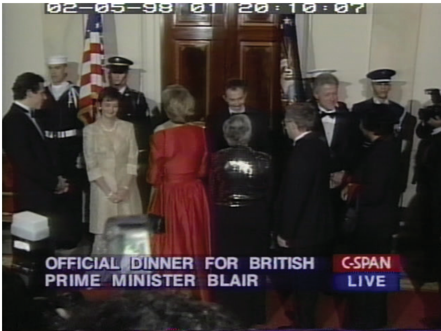
Figure 10.1 President Bill Clinton and other officials in a receiving line at an official dinner for British Prime Minister Tony Blair.

The queuing approach, where people stand in a line and await their turns to interact, is typical of events like book signings, graduations, or kids telling Santa what they want for Christmas. The focal person (or people) interacts with each person or small group of people individually. There are two main variations of the queuing approach. In the first, the line of people slowly moves past the focal person as those in the line await their turn to approach, such as in receiving lines. In the second, the focal person moves down a line of people who are generally standing still. These approaches are formal—rigidly controlled by social conventions if not by external authorities. The use of a line ensures that each person will have the opportunity to interact with the focal person individually as long as there is sufficient time and motivation for all parties concerned to devote. An example of this approach in action can be found in Figure 10.1.