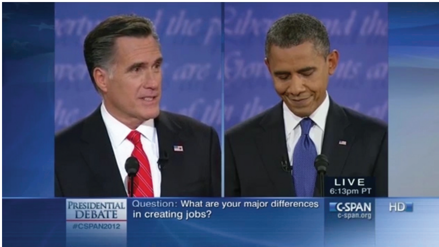
Figure 6.1 2Obama_2:09-2:27 (Romney attack): “But not due to his policies. (Obama AU R12 & 14) In spite of his policies. Mr. President, all of the increase in natural gas and oil has happened on private land, not on government land. On government land, your administration has cut the number of permits and licenses in half.”

(which would be seen with the muscles around the eyes—the orbicularis oculi —contracting). In Clips 3 and 5, his thrusting his tongue out likely indicates his rejection of Obama’s assertions and felt disgust (see Figure 6.2). Finally, Romney’s moderately pushing his lower lip up (AU 17) may be seen as indicating anger in both Clips 5 and 6.