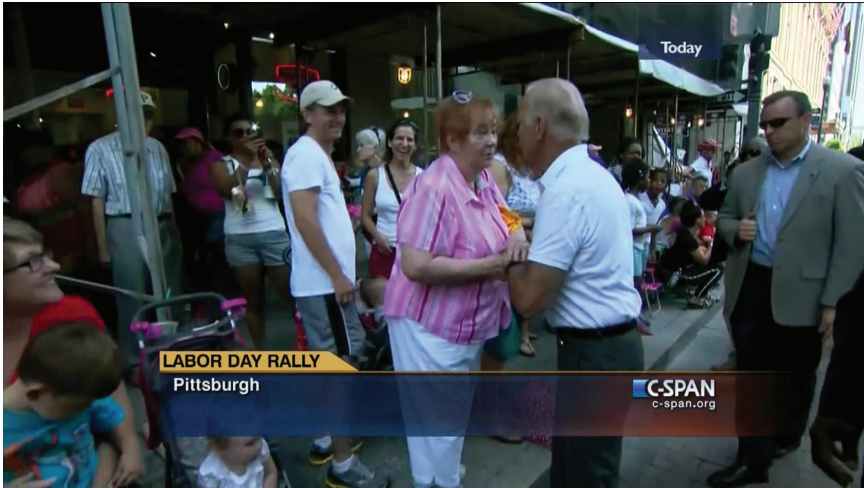
Figure 10.2 A man works the crowd haphazardly, along a street at a Labor Day rally in Pittsburgh.

a section of fans to sign autographs also is working the crowd. Unlike cases where there is a line, interaction is not guaranteed for everyone attending the event, even if interaction with everyone is a goal of the focal person. An example of this approach can be seen in Figure 10.2.