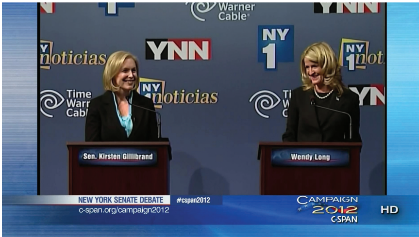
Figure 5.1 Screen shot of the 2012 New York U.S. Senate debate.

We use multiple methods to select the sample of debates for the analysis. First, we stratified the debates according to what type of candidates and contests are represented (incumbent in office, open seat). 8 Then, we took into account incumbency and partisanship. Finally, we looked at gender: Was a woman debating another woman? Was a woman debating a man? Was a man debating a man? Then, we randomly selected state/years within each category. If there was more than one debate for each state and each year, we randomly selected debates. Then, we checked the availability of each transcript. 9 These debates were analyzed: