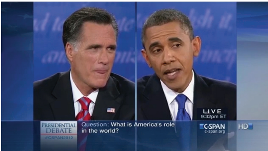
Figure 6.2 8Romney_1:29-1:44 (Obama attack): “Unfortunately, Governor Romney’s plan doesn’t do it. We’ve got to do it in a responsible way ( Romney AU 17, 19, 25 & 26 ) by cutting out spending we don’t need, but also asking the wealthiest to pay a little bit more. That way we can invest in the research and technology that’s always kept us at the cutting edge.”

Vigilant observers may see such signals as slight facial muscular movements, increased eye-blink rates, or head movements in response to unexpected acclaims, attacks, and defenses by the opposition or moderators. Ultimately it is the viewing audience that is most important for understanding and interpreting candidate response, whether accurate (as predicted by CPM application of FACS coding) or not. As a result, the next section first considers how accurately the CPM predicts viewer identification of emotions when applied through our FACS coding of the listening candidates’ facial display behavior. It next considers what influence the opposition candidate’s verbal utterances have on the accuracy of viewer interpretation of the listening candidate’s felt emotions.