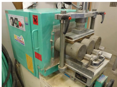
Figure 1. End Grinding Equipment