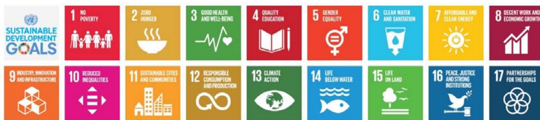
Figure 3. A summary of the 17 SDGs, adopted by all UN Member States in 2015

Given that we do not have a viable option of human habitability beyond Earth and that life on Earth is under serious threats, there is an urgent need to abide by a course of actions aimed at achieving the 17 SDGs (Figure 3). It is clear that the development of science and technology is the underlying critical factor to meeting these goals, from eliminating poverty (SDG1), hunger (SDG2), ensuring good health and well-being (SDG3), building infrastructure (SDG9), and bringing about clean water-sanitation (SDG6) and clean energy (SDG7), to name a few. Additionally, SDG4, which outlines the need for inclusive and equitable quality education for all, would lay the ground for science education and research in children and teachers at a global level. The UNESCO 2019 Forum on Education for Sustainable Development and Global Citizenship, which was hosted by Vietnam in July 2019, provides a venue to reflect on the policies and steps toward achieving the SDGs (MDPI, 2019).