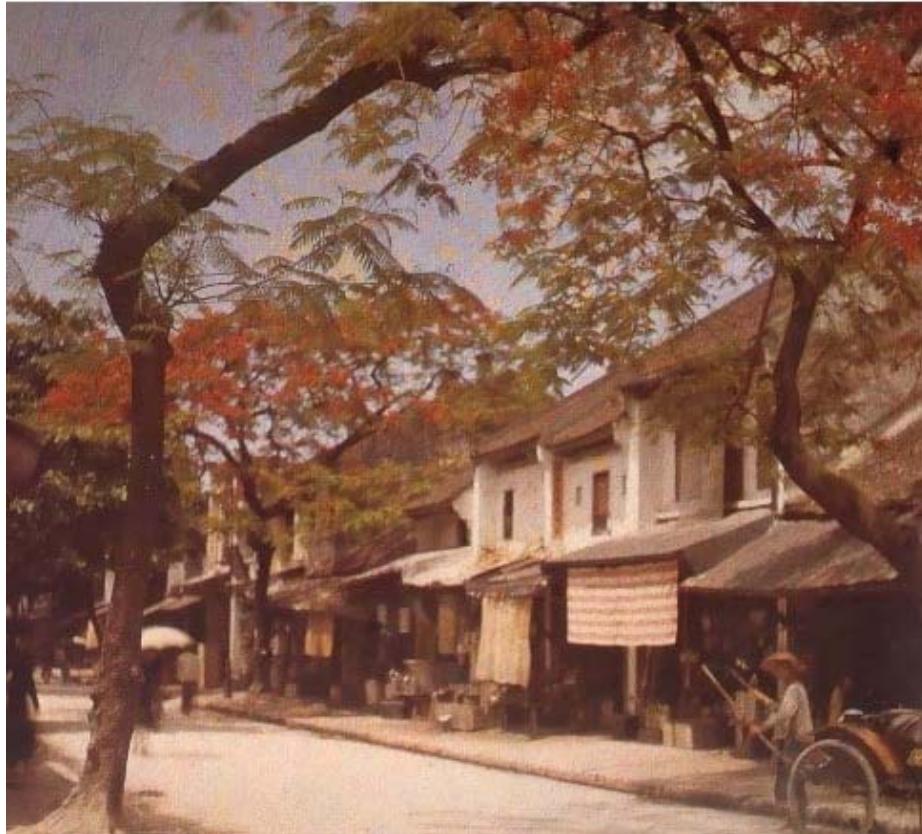
Figure 2: Hanoi in my memories.

Children’s literature reveals more than what it appears to tell. It is an important -- if not indispensable -- window, through which a generation would come to see different facets of life and human nature. I am fortunate or unfortunate enough to be one in those generations. Growing up in the mid-1970s, when the B52 bombing had become the past, my memories are a reflection of the images of a Hanoi where the Franco-Chinese houses (Vuong et al., 2019) hid among the lush greenery of big old trees.