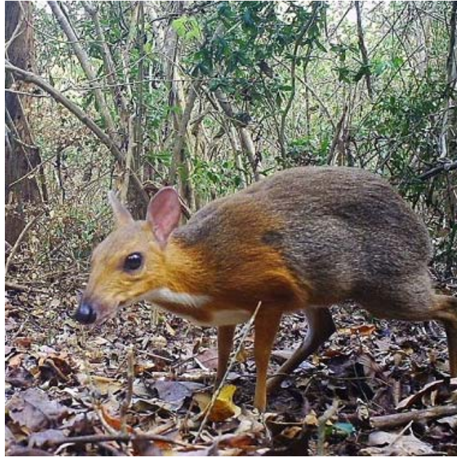
Figure 4. A photo of a Cheo cheo lưng bạc (silver-backed chevrotain Tragulus versicolor) that was recently re-discovered in Vietnam

evidence of a cheo cheo , a creature so endearingly drawn on the cover of the 1975 classic book “ Thú Rừng Tây Nguyên ” (lit. “Wild species of Central Highlands forests”) (Figure 5). The finding not only confirms the beauty of scientific discovery and collaboration but also ignites hopes for biodiversity conservation today.