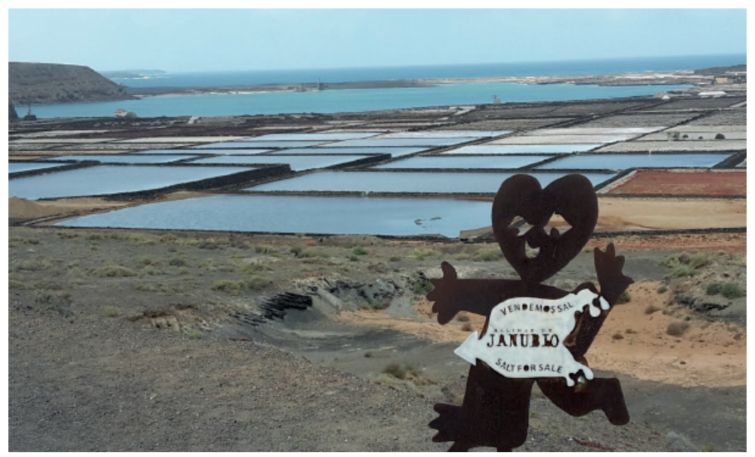
Figure 4: The entrance of the warehouse in Janubio