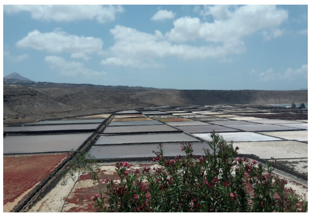
Figure 2: Janubio saltpans

Thanks to its natural and cultural heritage, the saltpans since 1987 have been included in the Canary Islands Network for Protected Natural Areas (Red Canaria de Espacios Naturales Protegidos), first as a natural landscape and as site of scientific interest nowadays. Its norms of conservation were finally approved on July 20, 2006, by the (COTMAC), "Ordenación del Territorio y Medio Ambiente de Canarias", and published in the "Boletín Oficial de Canarias 27/2007". Furthermore, are integrated in the core zone of the Lanzarote Biosphere Reserve, which includes conservation and landscape maintenance as one of the great values that justified the declaration by UNESCO in 1993. The entire surface of the Site of Scientific Interest is considered as an area of environmental sensitivity<sup>5</sup>.